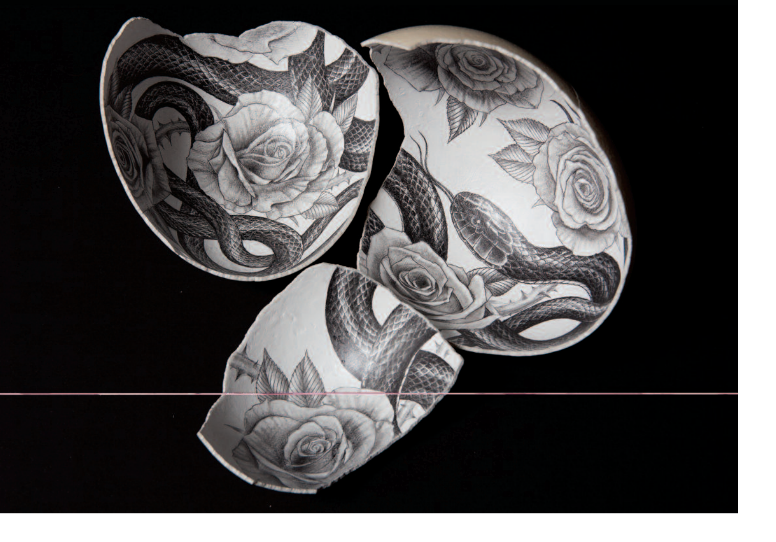
ABOVE Scott Campbell employs classic tattoo imagery in Untitled (Snake and Roses (white)), a graphite-on-ostrich-eggshell work, 2011. Below Intertwined female bodies are painted with tattoo-evoking patterns in Kim Joon's digital print Bird Land-Chrysler , 2008.