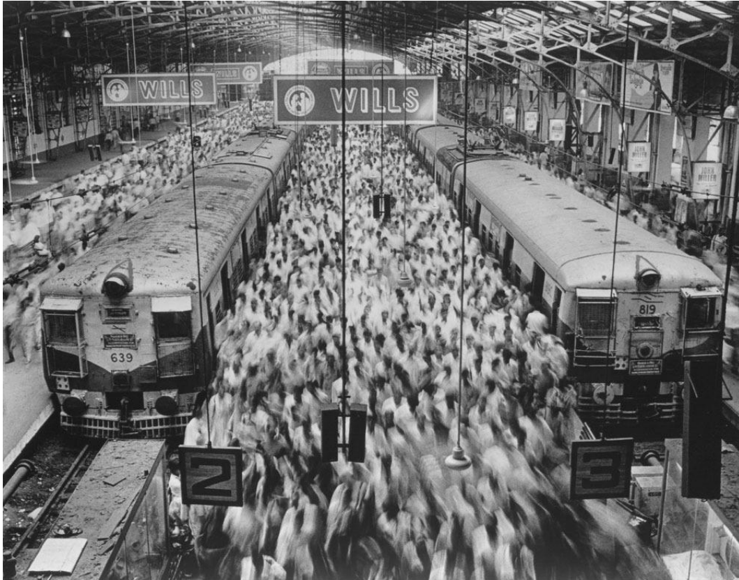
Sebastião Salgado, Church Gate Station, Western Railroad Line, Bombay India, 1995.