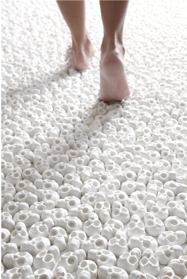
Nino Sarabutra What Will You Leave Behind?, 2012 Sundaram Tagore Gallery