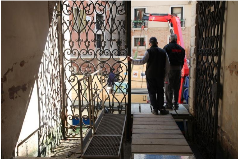
View of Museo di Palazzo Grimani, Venice.

“Expression is a human necessity. We need to express—and with that probably transform the world, hopefully in a better way,” Tagore replies when asked what he hopes viewers will take away from the exhibition. “Hopefully, that’s what the audience will carry with them—that it’s been meaningful, that they went to a place and it wasn’t about glitz and glamour. It allowed me to think and it extended my vision of the universe in some sense through these incredible works of art.”