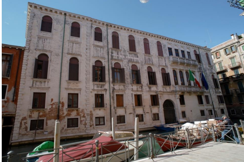
View of Museo di Palazzo Grimani, Venice.

artists globally—world art.’ And they would ask me, ‘World art? What does that mean?’” he recalls. Tagore’s inclination to embrace a global grouping of artists was prescient; in the current, increasingly globalized art world, the idea of “world art” goes without question—and there may be no better place to experience it than at the Venice Biennale.