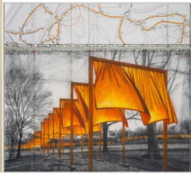
Christo The Gates, Project for Central Park, New York City, 2002 Sundaram Tagore Gallery