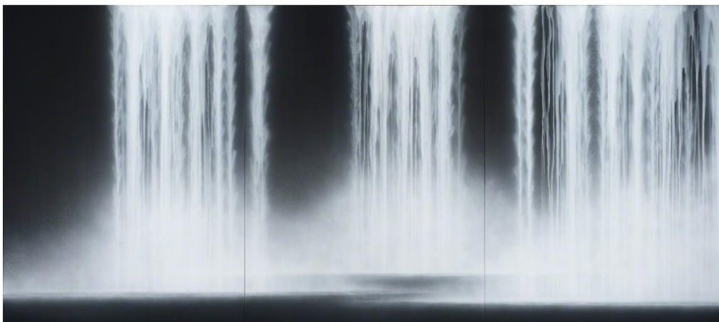
Hiroshi Senju Suijin, 2015 Sundaram Tagore Gallery