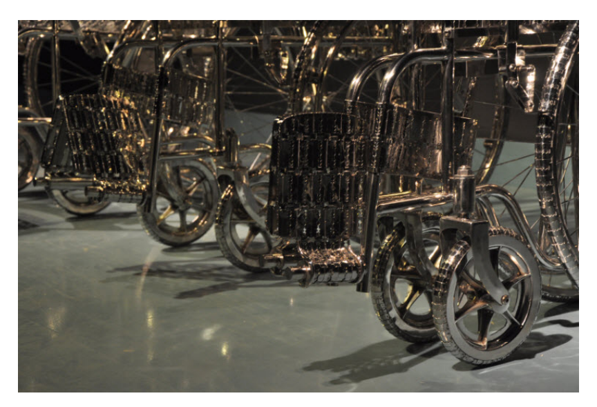
Tayeba Begum Lipi, Agony (detail).