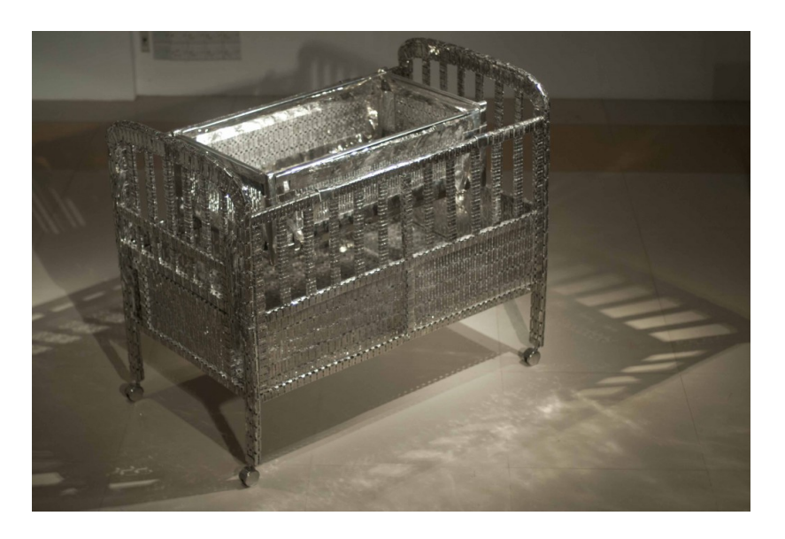
Tayeba Begum Lipi, My Daughter's Cot II , (2012). Stainless steel razor blades . 40 x 28 x 48 in. (101.6 x 71.1 x 122 cm.).

I am satisfied that I have never stopped working and never will until I have used all my energy. I was born in a very simple but culturally vibrant family in the countryside of Bangladesh. In a country such as Bangladesh, when someone aggressively pursues his or her artistic practice without knowing where it will finally anchor, I am blessed that I have made my name as an artist.