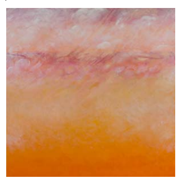
Left: Possibility , 2011, oil on canvas, 60 x 60 inches Right: There From Here , 2011, oil on canvas, 40 x 40 inches

Singapore, April 1, 2013 — For her first solo show in Singapore, New York-based artist Joan Vennum presents color-saturated paintings inspired by India.