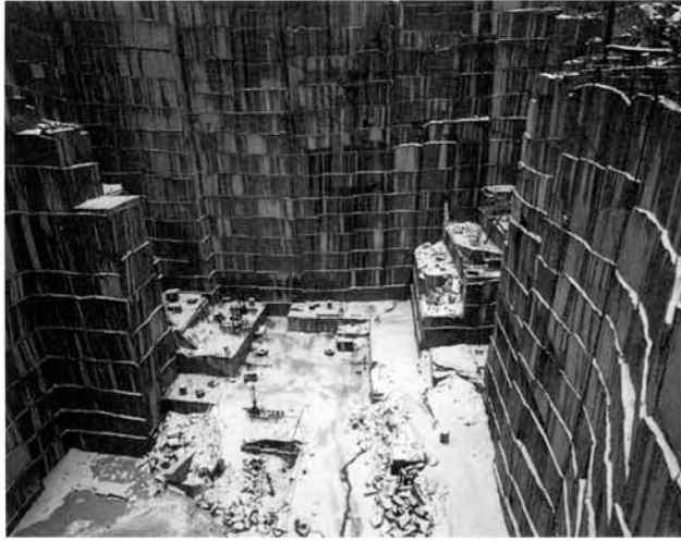
Edward Burtynsky, Rock of Ages #15, Active Granite Section, E. L. Smith Quarry, Barre, Vermont, 1992 , color photograph, 40 x 50".