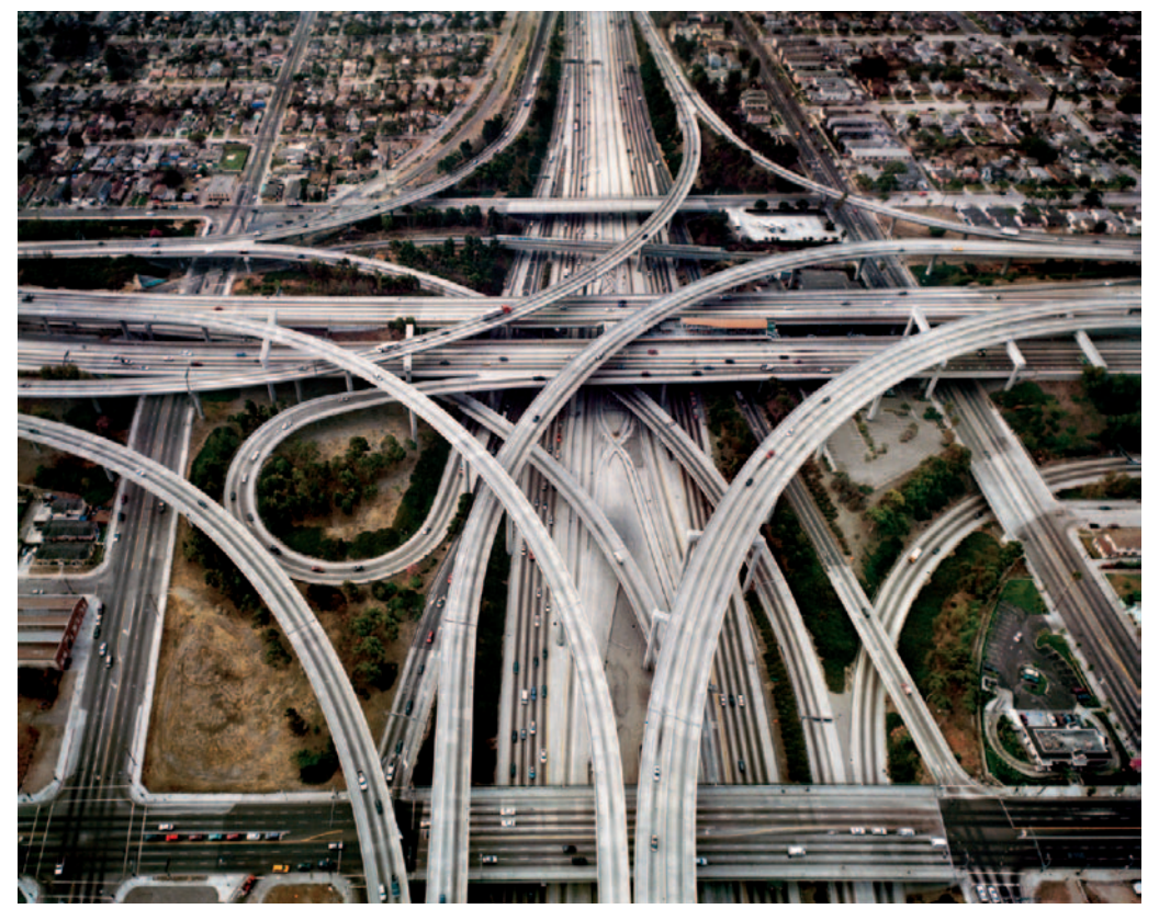
HIGHWAY #I, LOS ANGELES, CALIFORNIA, USA—2003