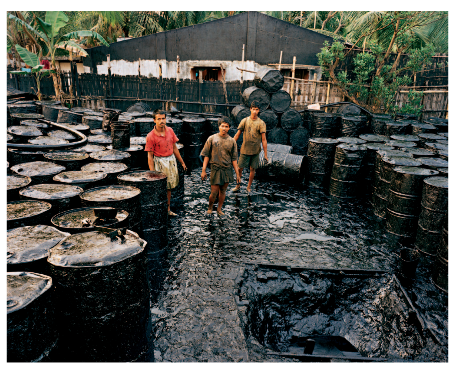
RECYCLING #2, CHITTAGONG, BANGLADESH-2001

Burtynsky also employs a cinematic approach to many of his images (a non-literal "before and after" narrative) as in the widespread urban renewal in China that shapes the comparison between "Wan Zhou #2, Three Gorges Dam Project, Yangtze River," and "Urban Renewal #6, Apartment Complex, JiangjunAo, Hong Kong." Creating the Three Gorges Dam, states Burtynsky's website, "relocated approximately 1.13 million people, the largest peacetime evacuation in history. Agricultural lands and cultural/historic sites were submerged. Thirteen major cities, 140 towns and 1,300 villages, along with 1,600 factories and mines, and an unknown number of farms vanished beneath the reservoir's surface," states Burtynsky's website. Wan Zhou was one such village. Here, it becomes a gray, tumbledown heap, sloping toward the river. Dismantled brick by brick by the vil-