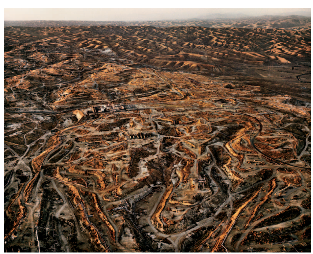
OIL FIELDS #27, BAKERSFIELD, CALIFORNIA, USA-2004