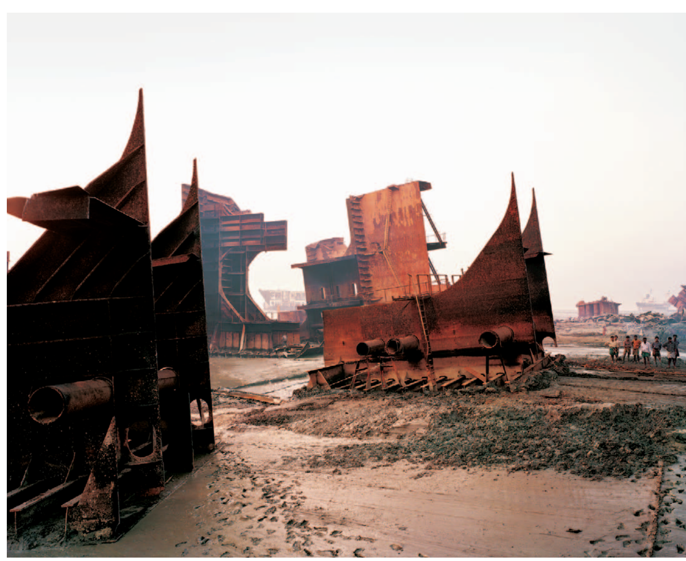
SHIPBREAKING #9 (DIPTYCH), CHITTAGONG, BANGLADESH—2000