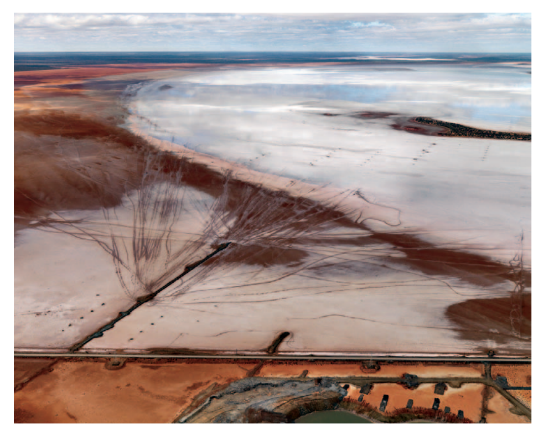
SILVER LAKE OPERATIONS #12, LAKE LEFROY, WESTERN AUSTRALIA—2007