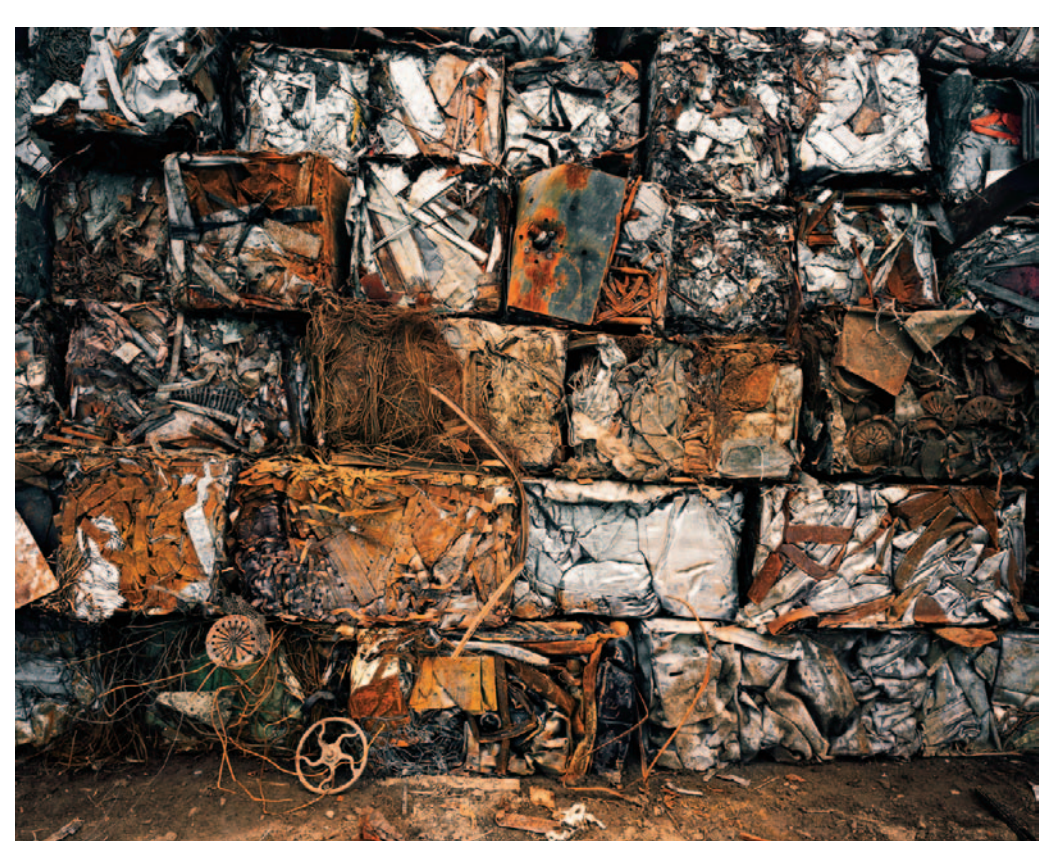
DENSIFIED SCRAP METAL #3A, HAMILTON, ONTARIO—1997