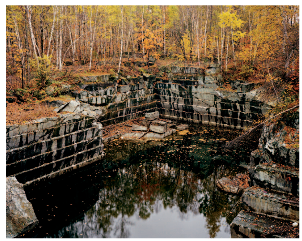
VERMONT MARBLE COMPANY #5, ABANDONED MARBLE QUARRY, ROCHESTER, VERMONT—1991