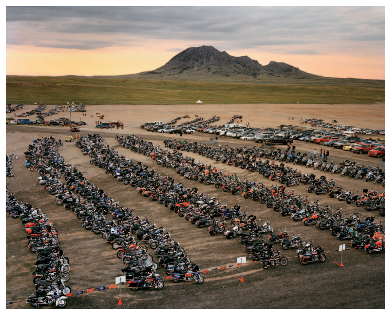
KISS CONCERT PARKING AREA, STURGIS, SOUTH DAKOTA, USA-2008

dusk or dawn light, imaging the nature they saw regularly surrounded by strip malls, freeways, Route 66 motels, and State Park parking lots. Their images loosened landscape photography from the grip of the idealized.