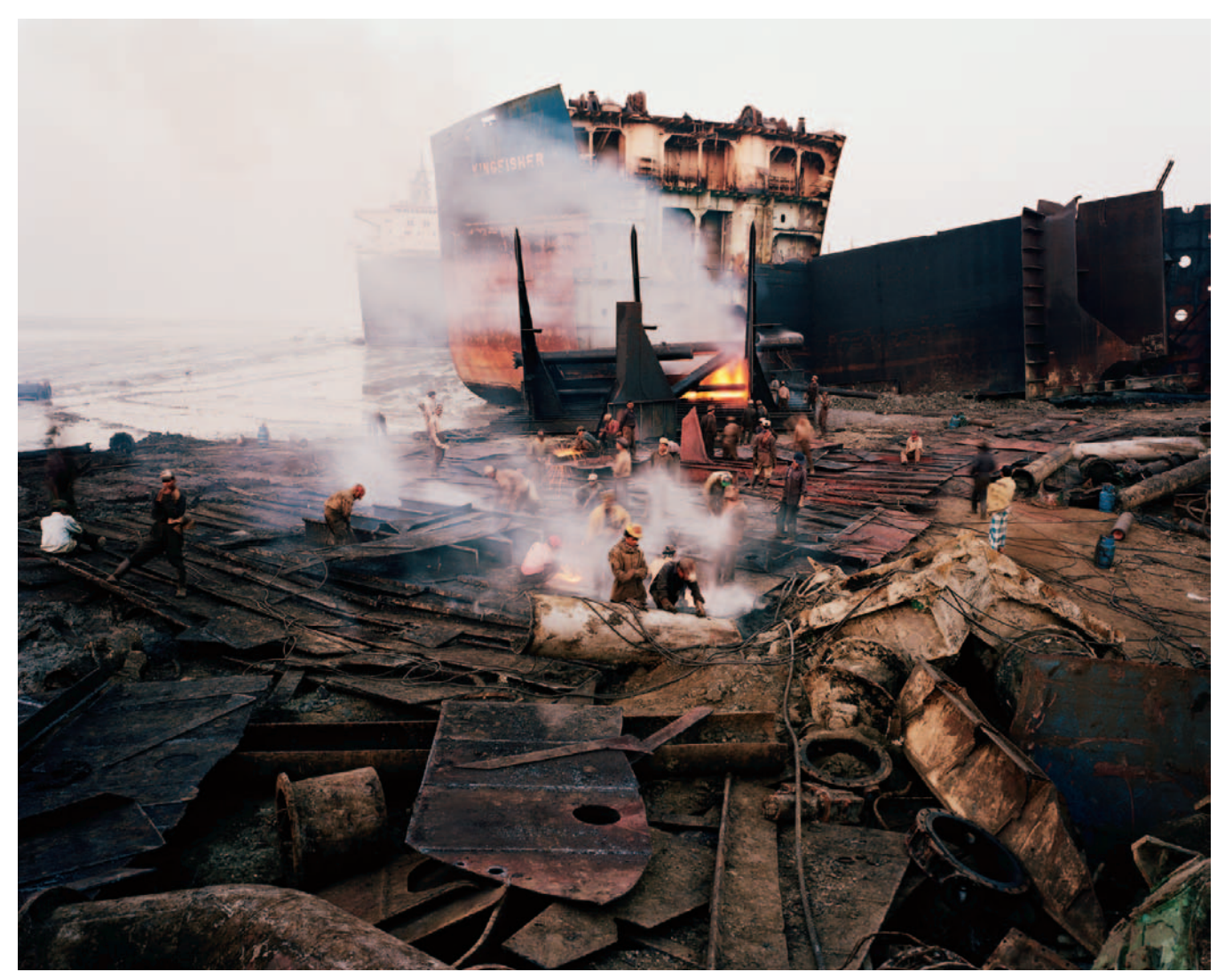
SHIPBREAKING #II, CHITTAGONG, BANGLADESH—2000

s oil drums proliferate, so too does another product of oil: tires. A single tire is made from approximately two gallons of oil. The Filbin and Oxford Tire Piles, located outside Westley, California, consist of 7 million tires on 40 acres of land. In certain areas, the piles are "six stories deep with tires pancaked flat at the bottoms of ravines from the crush of tons of other tires," says the CalRecycle website. In 1997, the site was ordered to incinerate 4 million tires to generate electrical power. In 1998, a nearby site caught fire, spewing toxic flames and smoke that burned for over two years. In Burtynsky's 1999 photograph, he gives only a glimpse of the tragedy through a cascading, vertical cleft of earth and grass (possibly a firebreak) that shapes the contours to the mountain of tires on either side. From the oil fields of Alberta and Azerbaijan, to this strange rubber crop in central California, Burtynsky's extraordinary knack of capturing the stuff of