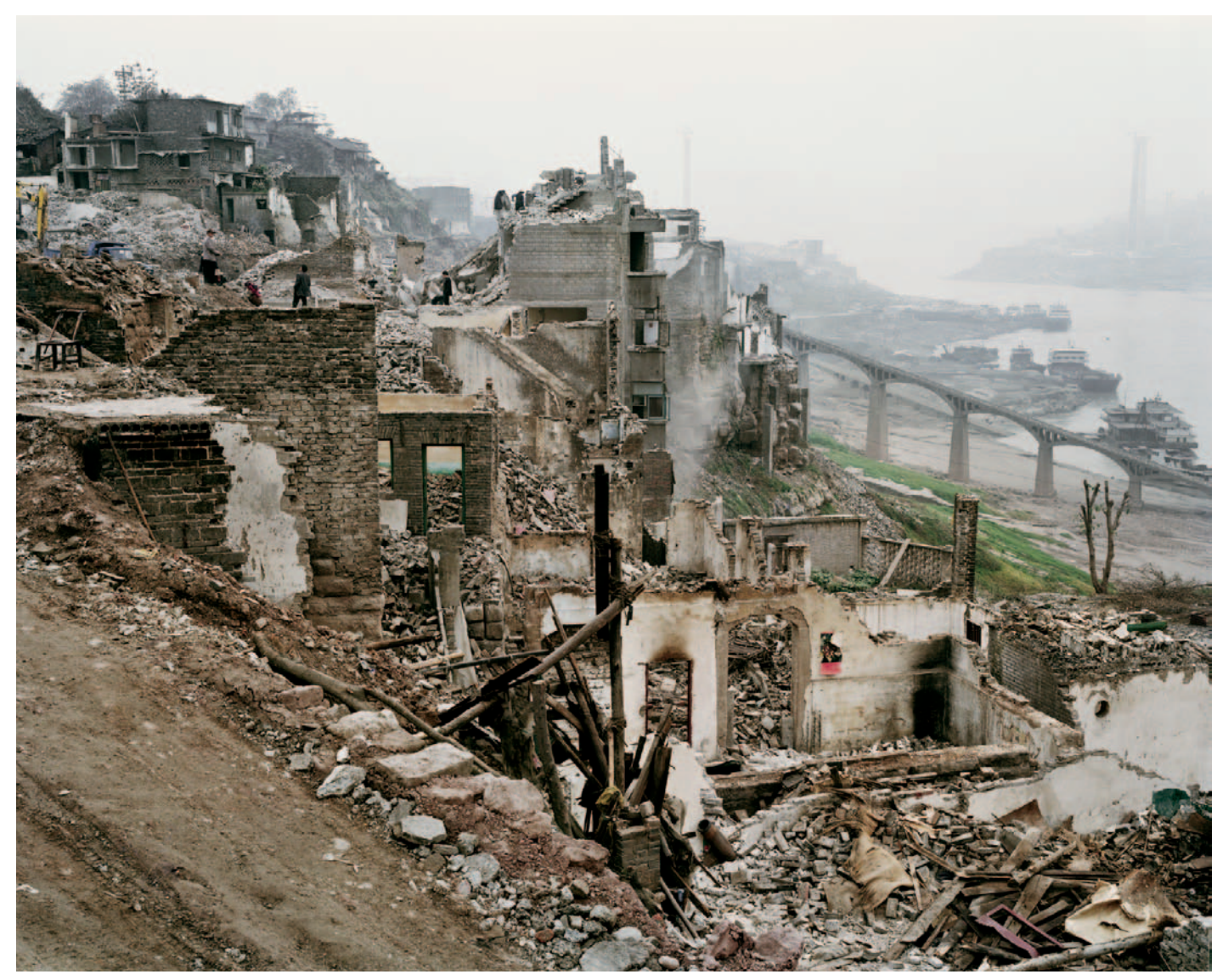
WAN ZHOU #2, THREE GORGES DAM PROJECT, YANGTZE RIVER—2002