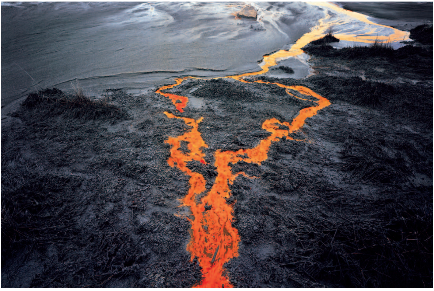
NICKEL TAILINGS #31, SUDBURY, ONTARIO—1996

the celebrated 19th- and 20th-century wilderness or industrial landscape painters and photographers from both Canada and the U.S., Charles Comfort, Charles Sheeler, Carleton Watkins, and Margaret Bourke-White. "The more you comprehend your indebtedness to your predecessors in art," says Burtynsky, "the more you can let those influences enrich your own work."