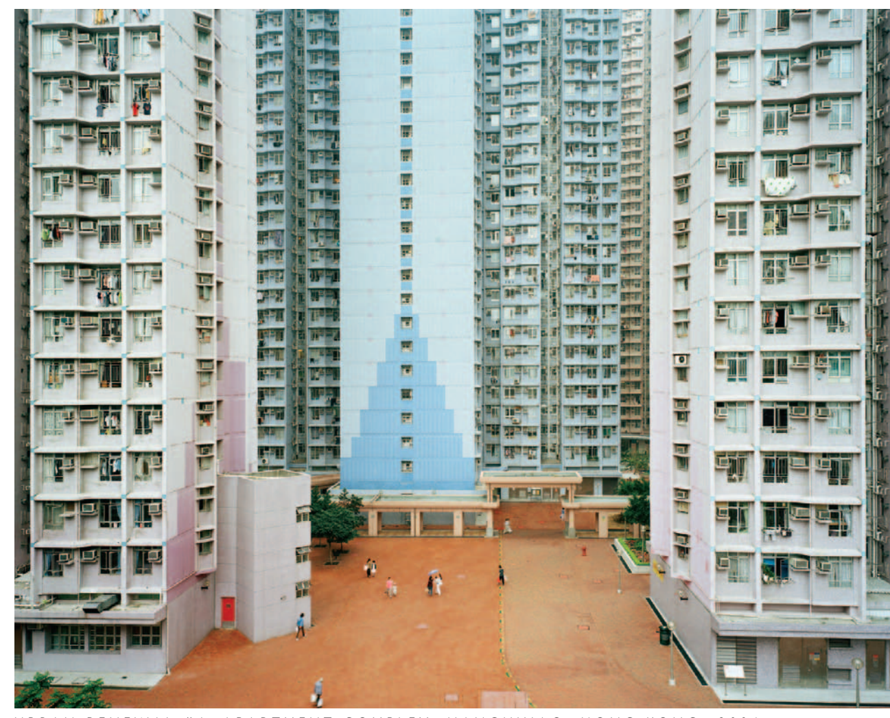
URBAN RENEWAL #6, APARTMENT COMPLEX, JIANGJUNAO, HONG KONG-2004

lagers themselves, each received money for materials that could be recycled. By comparison, JiangjunAo, Hong Kong, consists of building rather than dismantling. It is a series of new, colorful, apartment towers soaring vertically. Burtynsky doesn't serve us either view straight up. Our eyes, at Wan Zhou, are allowed to traverse the hill, as well as far into the distance, a landscape that will soon be submerged. JiangjunAo's countless cubicles speak to conformity, in a scale that dwarfs the pedestrians below, with no horizon line or way out. In each there is a single tree—one dead, the other green—that stands as a metaphor for the death of a former way of life giving way to the rapacious birth of another.