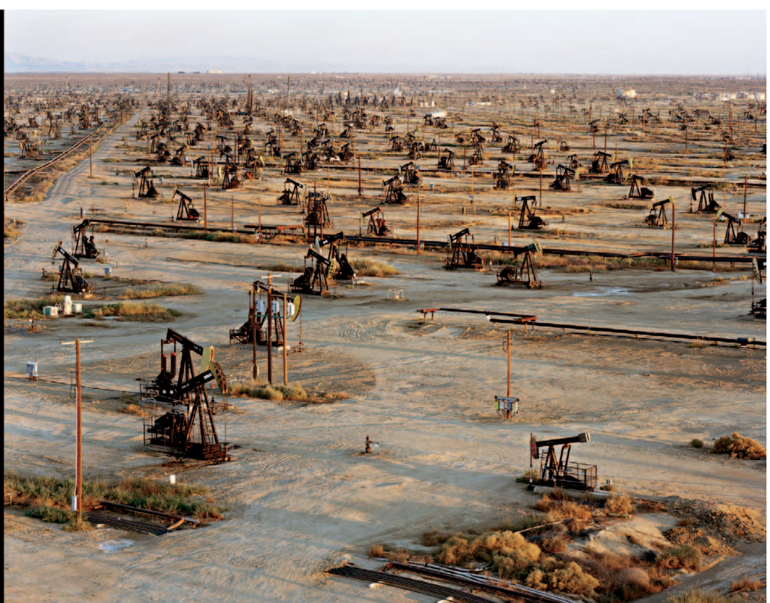
OIL FIELDS #19 (DIPTYCH), BELRIDGE, CALIFORNIA, USA-2003

Our dependence on nature to provide the materials for our consumption, and our concern for the health of our planet sets us into an uneasy contradiction. — Edward Burtynsky