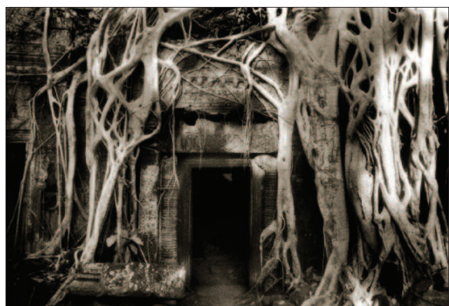
The Golden Dome, 2011, depicts the Tantkyi Taung Pagoda in Myanmar (top). Solar Eclipse, 1995, shot at the Angkor Wat temples (above left). Ta Prohm Doorway, 2012, shows Angkor Wat's signature trees (above right). Elephants at the Gate, 2000, in Angkor Thom (bottom).

sunlight is guiding his lens even further afield, all the way to the monumental complex of Petra, in Jordan. "I still have a fridge full of rolls of discontinued infrared film, because it gives me the basis for that ethereal appearance I am looking for," the photographer says, "and I love the way it maintains the stones' darker texture against the light."