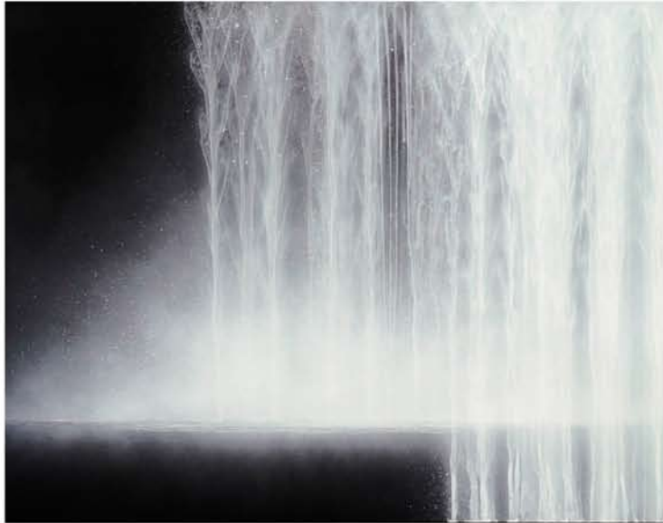
Hiroshi Senju, Waterfall (2009).

For fans of Hiroshi Senju, a new museum is about to open in Karuizawa – the Hamptons of Tokyo – that will be dedicated to the artist’s body of work, spanning the years of 1978 – 2011. With roughly 100 pieces on display, the artist hopes the museum will become a timeless structure that will live and breathe in conjunction with beautiful lush surroundings. And who better to implement his hopes than architect Ryue Nishizawa – one part of the duo SANAA – who has designed a stunningly beautiful open space with very few limitations to the flow of people, something that is akin strolling through the woods.