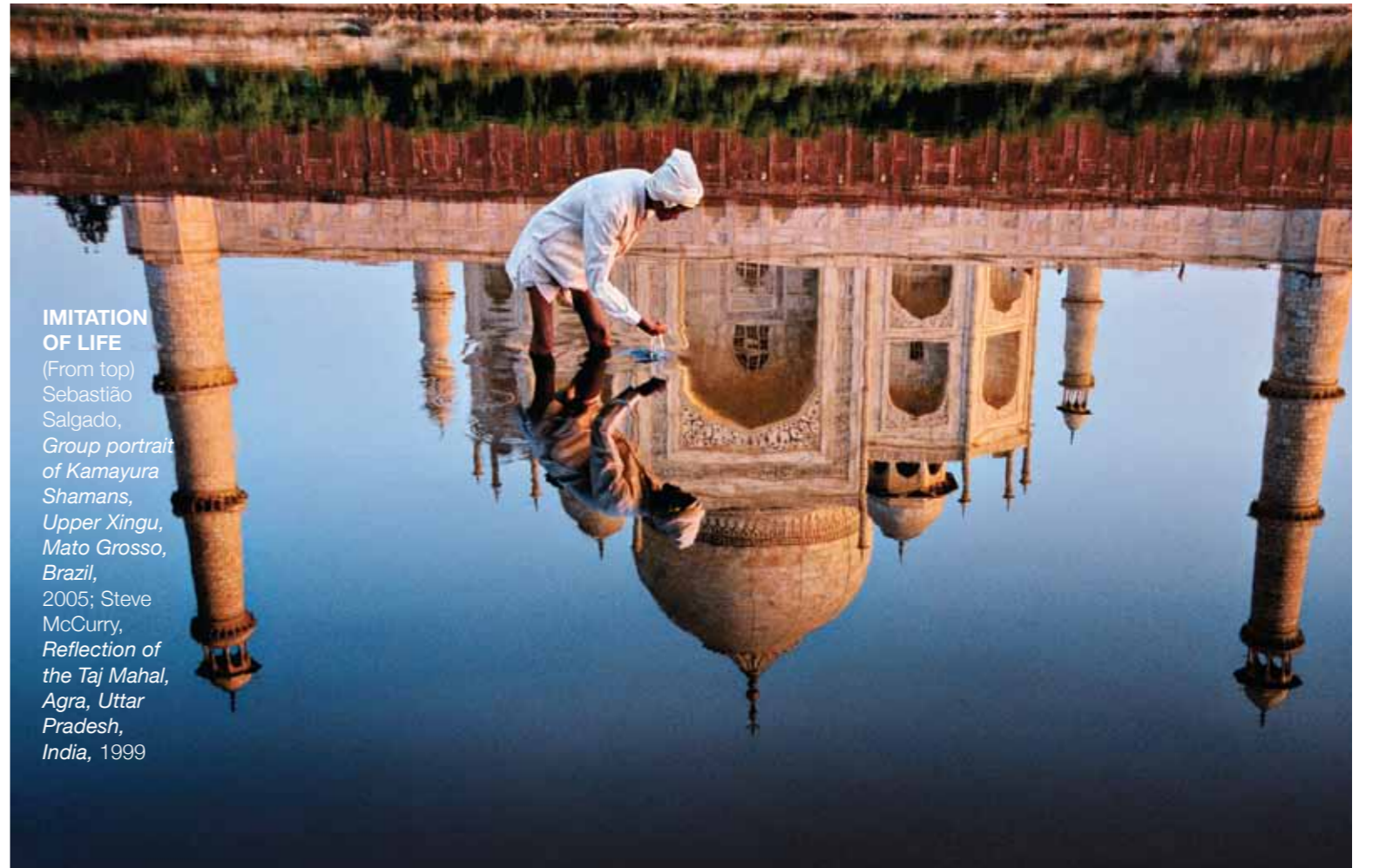
IMITATION OF LIFE (From top) Sebastião Salgado, Group portrait of Kamayura Shamans, Upper Xingu, Mato Grosso, Brazil, 2005; Steve McCurry, Reflection of the Taj Mahal, Agra, Uttar Pradesh, India, 1999