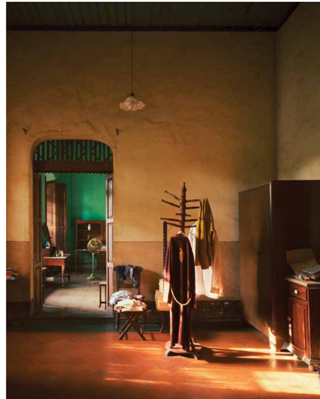
HAUNTING IMAGES Robert Polidori, Alvares Residence, Bedroom #2, Margao, Goa, India , 1998; (opposite) Steve McCurry, Sharbat Gula, the Afghan Girl, at Nasir Bagh refugee camp near Peshawar, Pakistan , 1984

“ I KEEP TAKING PHOTOGRAPHS probably for the same reason I keep breathing, eating, and sleeping,” says Steve McCurry. “This is just what I do.”