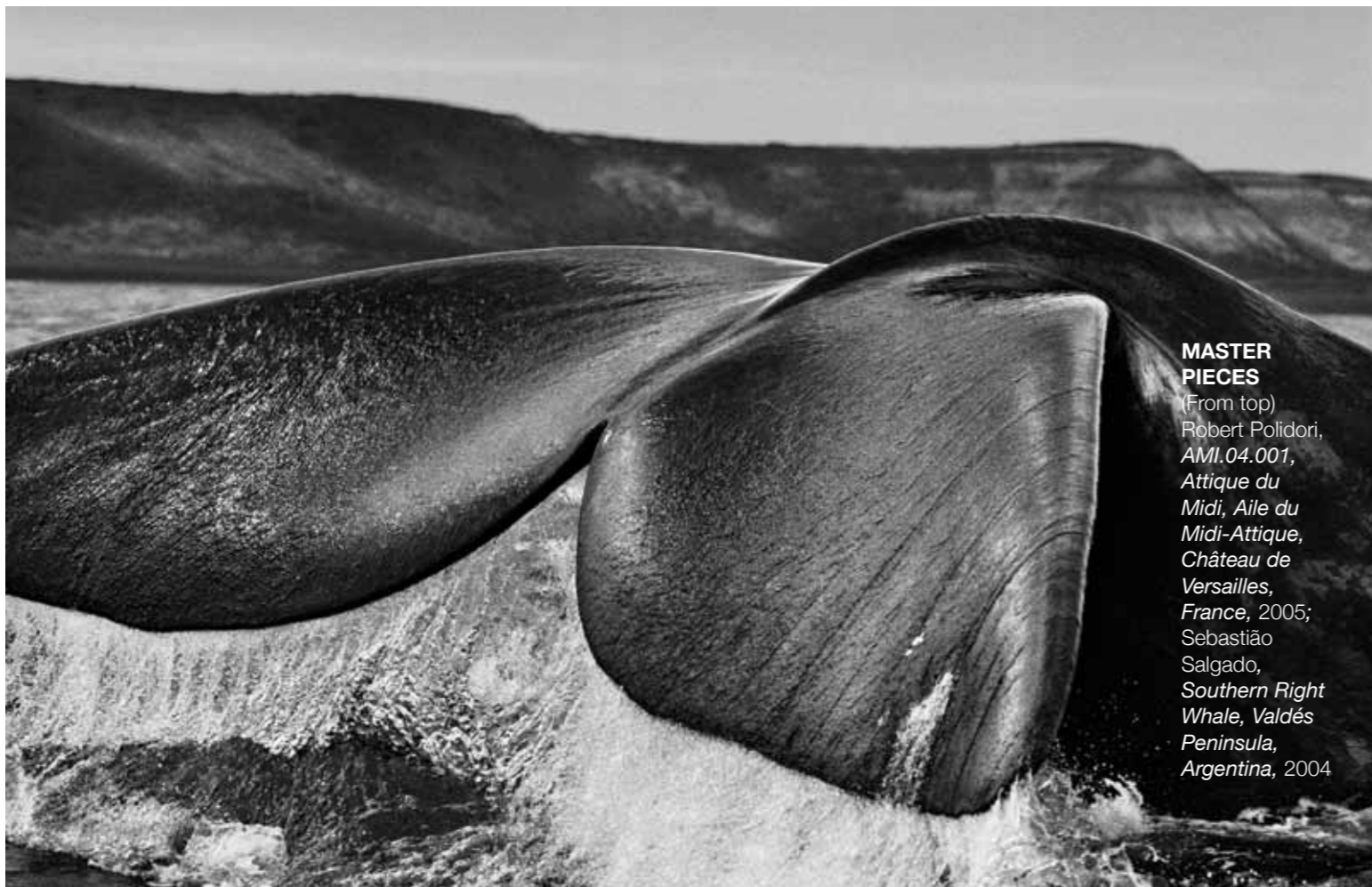
MASTER PIECES (From top) Robert Polidori, AMI.04.001, Attique du Midi, Aile du Midi-Attique, Château de Versailles, France, 2005; Sebastião Salgado, Southern Right Whale, Valdés Peninsula, Argentina, 2004