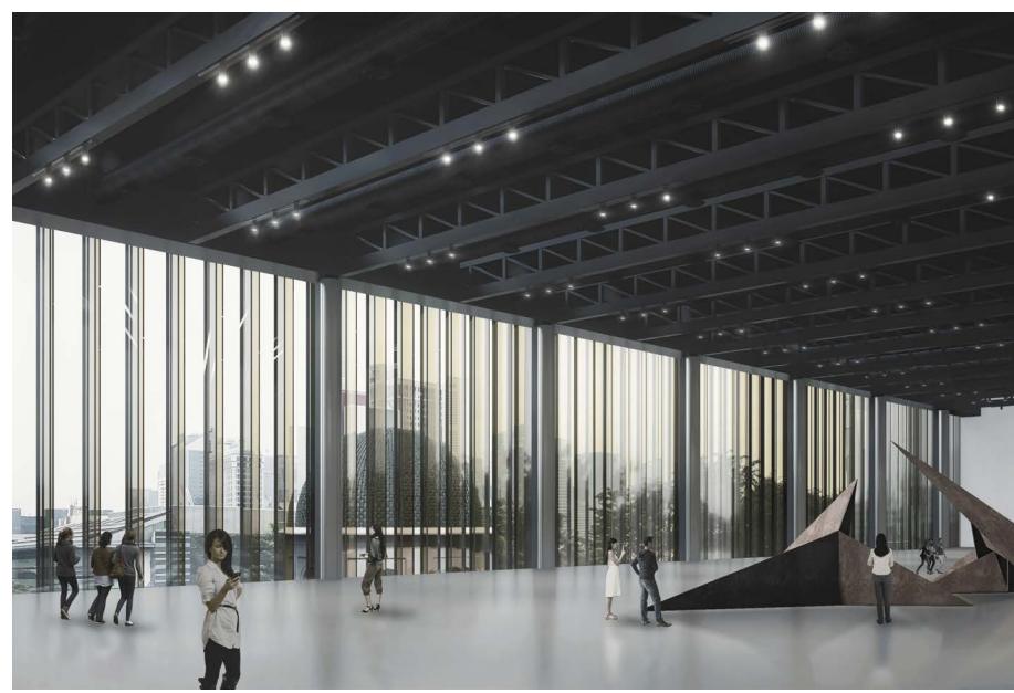
The new Singapore Art Museum, designed by SCDA, will bring contemporary architecture into the museum's heritage buildings and introduce new spaces for the public to engage with art. The new complex will include an entrance plaza (top) and a purpose-built Sky Gallery (bottom)