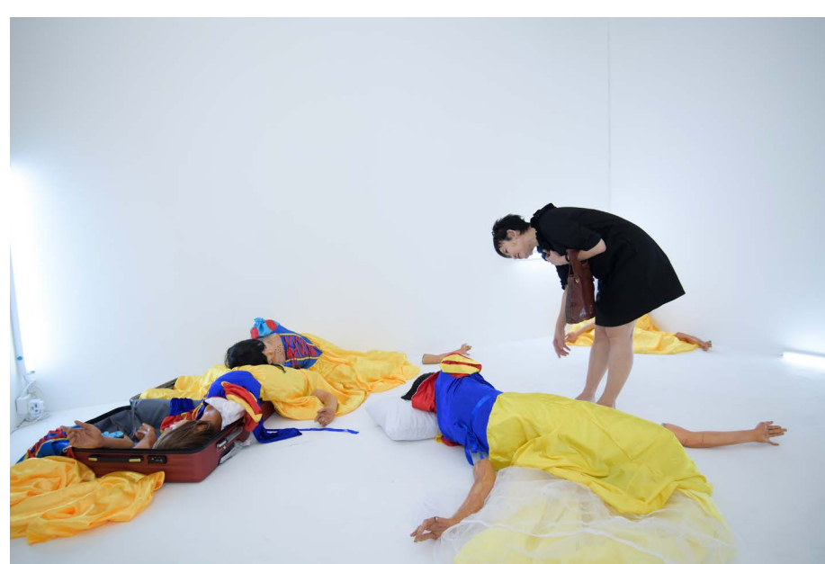
2020 saw the second edition of S.E.A. Focus, a Singaporean event created to showcase South East Asian contemporary artists