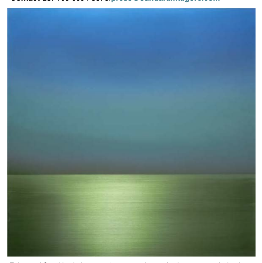
Ephemeral Sapphire Jade, 2015, pigment, urethane, aluminum, 48 x 48 inches/122 x 122 cm

Private preview with the artist: Thursday, October 29, 6 to 9 pm Contact us: +65 6694 3378/press@sundaramtagore.com