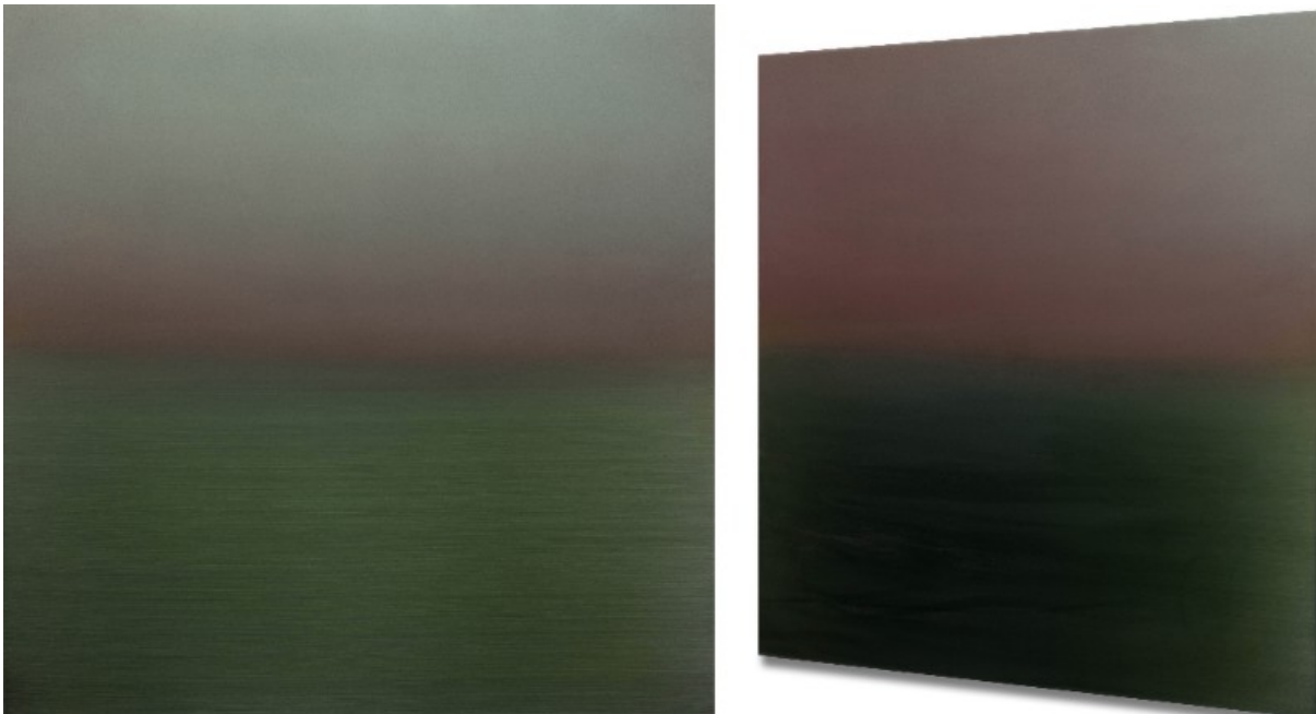
Left and right: Olive Shift , 2016, urethane on aluminum, 36 x 36 inches/92 x 92 cm

Contact us: press@sundaramtagore.com / 212-677-4520