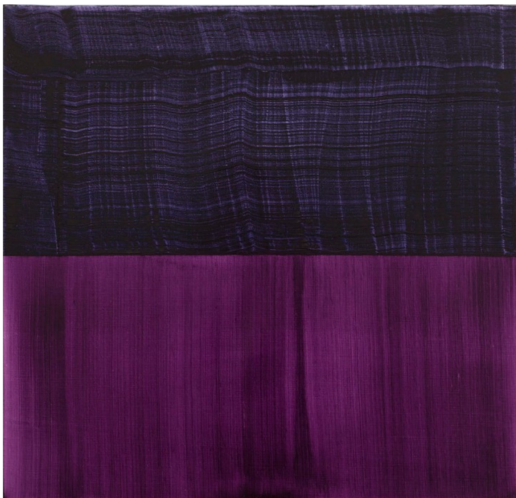
[5], 2016, oil on linen, 23 x 24 inches/58.4 x 61 cm