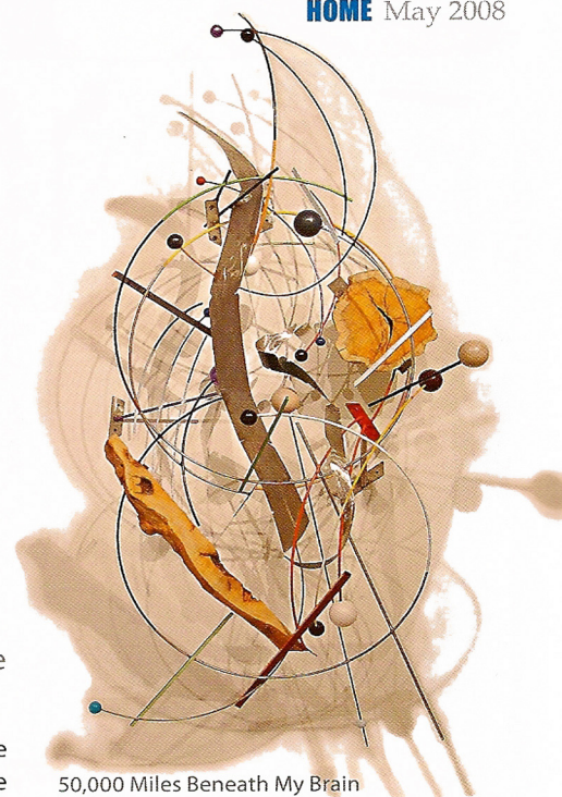
50,000 Miles Beneath My Brain