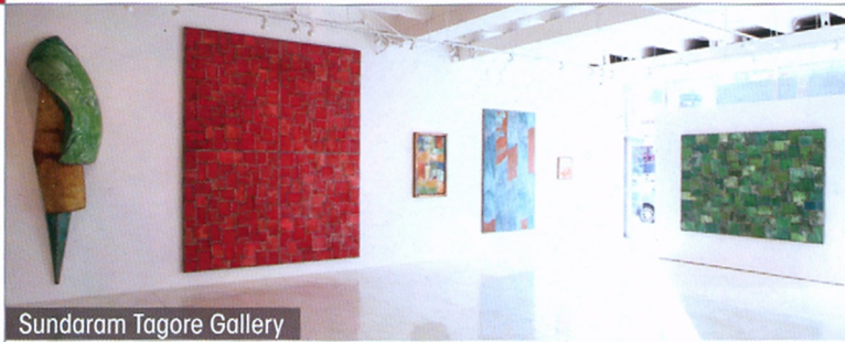
Sundaram Tagore Gallery

at the Sundaram Tagore Gallery, Beverly Hills