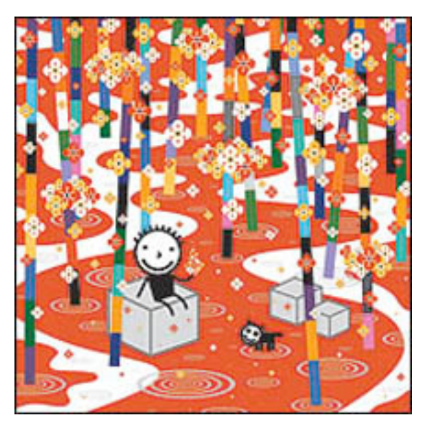
Red River Flowing With Flowers Flame, by Kwon Ki-soo