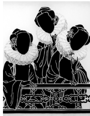
Detail of Ambiguous Space aka Hua Xuan By Annysa Ng, 2009 China 2000

14th century (height 6.5 cm). (19-26 March; 42 East 76th Street)