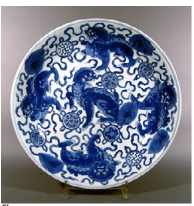
Charger China, Shunzhi/early Kangxi period, c. mid-17th century Ralph M. Chait Galleries

The 'Ralph M. Chait Galleries Spring Exhibition' will include various objects from private collections, including porcelain, hardstones and works of art. One such object, from an American collection, is a Chinese blue-and-white porcelain charger from the Shunzhi/early Kangxi period painted with five Buddhist lions on the interior (diameter 51.5