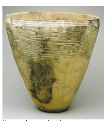
Kamegaoka-type deep jar Japan, Final Jomon period (1000-300 BCE) London Gallery, Ltd (Tokyo)

Tokyo's London Gallery will mount an exhibition of Japanese ceramics at Sebastian Izzard's gallery. featuring works that span well over 1,000 years of history. 'Forms Unbound' welcomes viewers to explore a variety of ceramic types that, while representative of the periods they were created in, continue to resonate with and speak to contemporary audiences. Pottery and