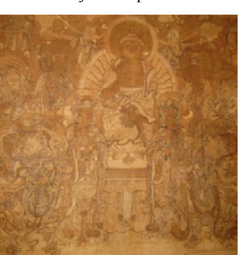
Buddhist pantheon Korea, Joseon period, 18th century

to focus on just ten pieces in her '10th Anniversary Exhibition of