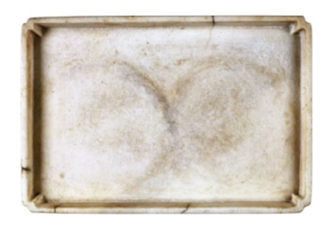
Tray China, 18th century MD Flacks

MD Flacks continues its series focusing on 'small treasures' and scholar's objects this spring with their show titled 'Scholar's Trays'. Trays were seen as an essential part of the scholarly ideal so venerated in China, and were used in the scholar's studio as part