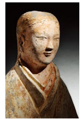
Detail of female figure China, Western Han period (206 BCE-8 CE) Courage & Joy, Inc.

The exhibition 'Transition to Empire: Art from the Warring States to Han China' at Joe-Hynn Yang's gallery Courage & Joy follows on from his inaugural exhibition in 2010 focusing on Chinese material culture of 1,000 years ago. This time, the works of art on show, which go back a further thousand years, reveal how the political and cultural diversity of the Warring States period reaches a unified aesthetic under the imperial Han dynasty. From this later period is a figure of a kneeling female musician in earthenware with low-