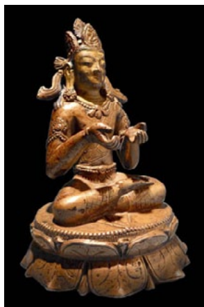
Vajrabodhisattva Nepal, 9th/10th century Carlo Cristi

Carlo Cristi will be exhibiting Himalayan thangkas and bronzes. Notable works include an 11th century gilt-bronze image of the bodhisattva Manjushri and a 14th century thangka portraying Mahakala in the aspect of Yeshe Gonpo, seated in the posture of