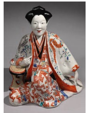
Seated beauty Japan, Edo period, late 17th century Sebastian Izzard

In bold contrast to Dragons in Clouds is Hokusai's ukiyo-