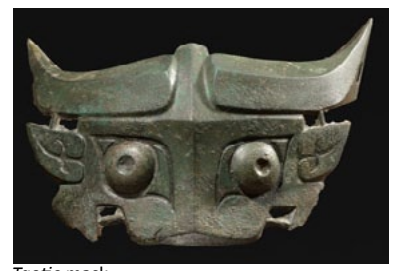
China, early Western Zhou period, 10th/9th century BCE J. J. Lally

carving, perforating, enamelling, glazing and gilding. A 2007 work by Taro Tabuchi, titled Kozuchi , is in unglazed porcelain, iron and