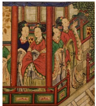
Detail of Guo Ziyi's Banquet Korea, 19th century Kang Collection

miniature paintings, acquired mainly in the 1970s and '80s. Several were purchased from Colnaghi in the late 1970s, and others at auction. A Mughal work in opaque watercolour with gold on paper titled An assembly of royal pigeons round a dovecote ( circa 1660) depicts prize pigeons that would have been kept by special trainers for the amusement of the emperor. On the reverse are ten lines of nastal'iq calligraphy. From the desert state of Bikaner is a circa 1670 illustration of the story, Madhavanala faints when he sees the beauty of Kamakandala (26 x 25.5 cm), inscribed 'work of the imperial master', which was formerly in the Paul Walter collection. (18-26 March; 9 East 82nd Street, Suite 1A)