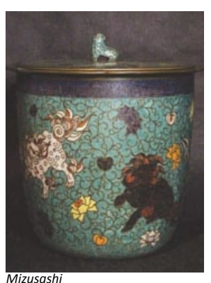
Japan, Edo period, 17th/18th century