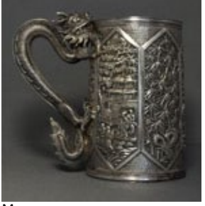
Mug China, mid-19th century Robyn Turner

the shape of a magnolia flower (height 12 cm). A highlight of Powley's is a figure of Shouxing, the Chinese god of longevity, in gold appliqué, from the 19th century (height 14 cm), which was published in Spink & Son Ltd's catalogue Chinese Jewellery and Glass (1989, no. 66, p. 36). (19-26 March; The Carlyle Hotel, 35 East 76th Street)