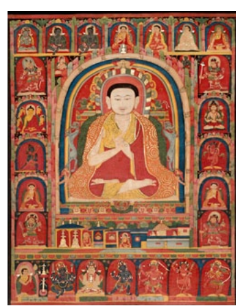
Portrait of Tashipel Tibet, c. 13th century Carlton Rochell

Carlton Rochell will show some twenty examples of 'Indian, Himalayan and Southeast Asian Art', ranging in date from the 2nd to the 18th century. Most of these works, including sculptures and