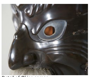
Detail of Okina somen Japan, mid-Edo period Shakudo Fine Arts