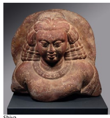
Shiva India, Uttar Pradesh, Gupta period, 5th century Dalton Somaré

Dalton Somaré's exhibition 'Early Indo-Buddhist Art' will present art from the Indian subcontinent in the three rooms of The Pace Gallery. The earliest works include a copper anthropomorphic figure from the Gangetic Plains dating to the 2nd millennium BCE, while the period from the 6th to the 11th century is represented by Indian and Nepalese stone images