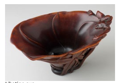
Libation cup China, Wanli period, 1582 Eskenazi, Ltd

of a temple panel from eastern India, Bihar or Bengal, depicting a dancing Shiva and dated to the 5th/6th century during the Gupta period, the zenith of terracotta art. (16-30 March; Williams, Moretti and Irving Gallery, 24 East 80th Street)