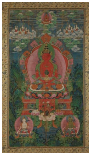
Amitayus China, Chengdu, Xumifushou temple, 1779-80 Leiko Coyle Asian Art

Tang period. Metal works include a 17th century gilt-bronze and copper repoussé figure of Lhamo, the Glorious Goddess, from the Pan-Asian Collection assembled by New York financier Christian