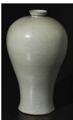
Maebyeong Korea, Goryeo period, 12th century

the form of a melon surmounted by a bushy-tailed squirrel holding a bunch of grapes. The work was acquired in Shanghai by collector/dealer Walter Hochstadter in the 1950s. A Ming period rhinoceros horn libation cup, carved in the shape of a hibiscus flower with a dragon clambering up its stem, is inscribed with a date corresponding to 1582 and a poem referring to two of the legendary seven sages of the bamboo grove, Ji and Ruan (11.5 x 19.4 cm). Also in rhinoceros horn is a figural carving of Bodhidharma from