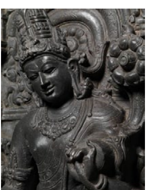
Detail of Avalokiteshvara India, 11th/12th century