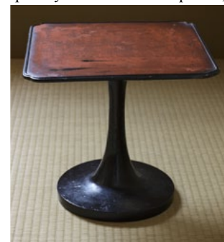
Stem table Japan, Northern and Southern Courts period, 14th century Mika Gallery

an 11th century shinzo , or Shinto deity, and a 13th/14th century gold icon of the Buddha Amida, along with other, pre-14th century Buddhist works. Also highlighted is a 14th century Negoro lacquer stem table passed down through the Kinpusen-ji Zaodo in Yoshino, Nara (30.6 x 32.7 x 32.7 cm). (15-23 March; 595 Madison Avenue, Fuller Building, 8th floor)