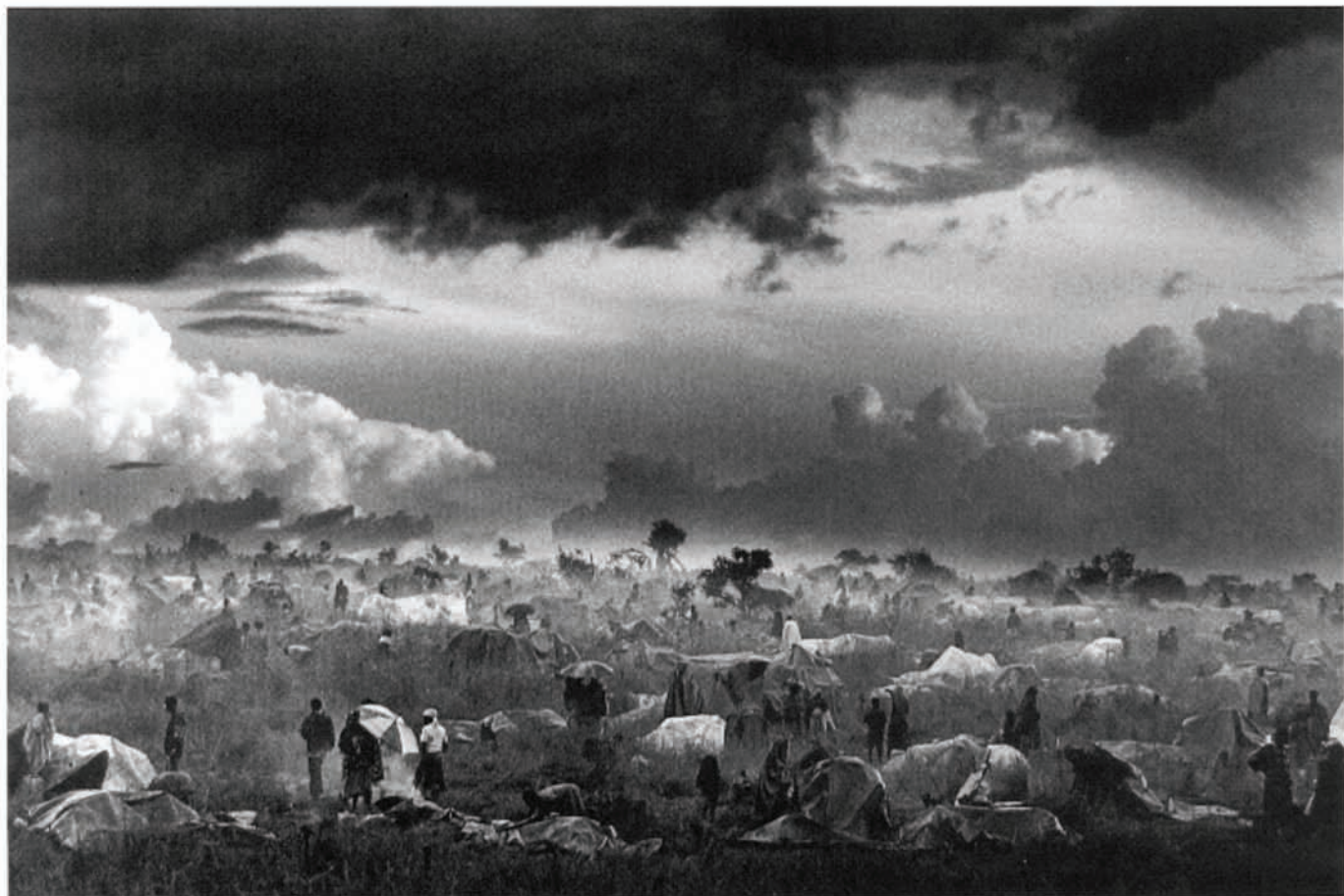
THE FIRST DAY OF INSTALLATION OF THE CAMP OF BENAKO FOR THE RWANDAN TUTSI AND HUTU REFUGEES. TANZANIA - 1994

its rawest form, individualism remains a prescription for catastrophe. We have to create a new regimen of coexistence."