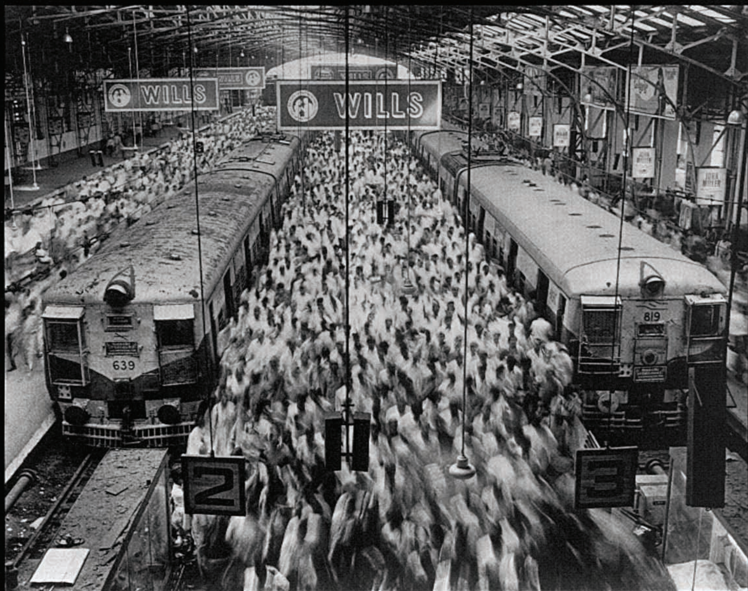
Sebastião Salgado. Church Gate Station, Western Railroad Line, Bombay, India, 1955

FOR ONE OF THE LARGEST INVENTORIES OF CLASSIC PHOTOGRAPHY PLEASE VISIT WWW.PETERFETTERMAN.COM