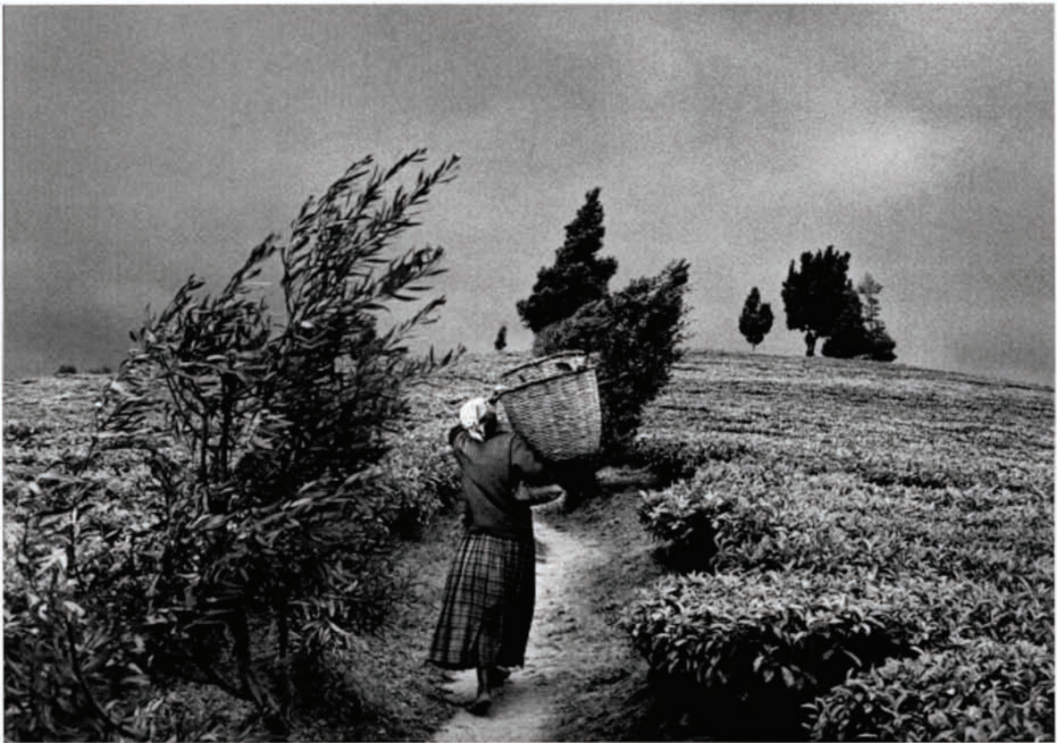
IN THE HILLS OF MOKO AT THE GISOVO TEA PLANTATION. RWANDA - 1991