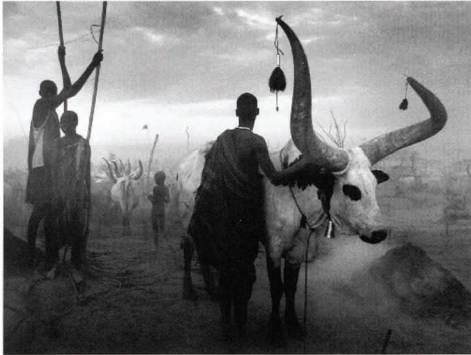
DINKA GROUP AT PAGARAU CATTLE CAMP. SOUTHERN SUDAN - 2006