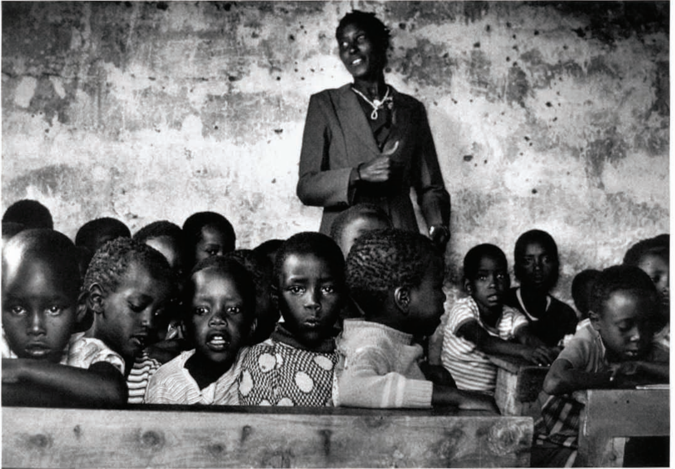
SCHOOL IN THE LAKE VICTORIA REGION KENYA - 1986