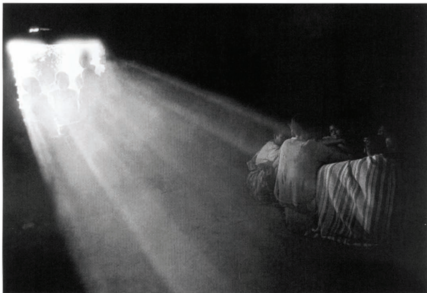
BOYS FLEEING FROM SOUTHERN SUDAN TO AVOID BEING FORCED TO FIGHT IN THE CIVIL WAR. HEADING FOR THE REFUGEE CAMPS OF NORTHERN KENYA. SOUTHERN SUDAN - 1993

horror and degradation that often shadow life in Africa and other impoverished regions, but also illuminate the resilience and forbearance of the people who live there. In an increasingly cynical age, Salgado's positive-skewing thematic is refreshing.