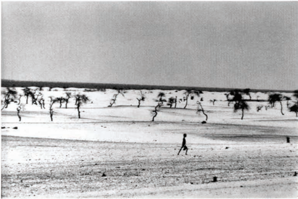
THIS USED TO BE THE LARGE LAKE FAGUIBINE. IT DRIED UP LITTLE BY LITTLE WITH THE DROUGHT AND INVASION OF THE DESERT. ALL OF THE MEN HAVE GONE, ONLY THE CHILDREN, THE ELDERLY AND THE WOMEN REMAIN, MALI - 1985