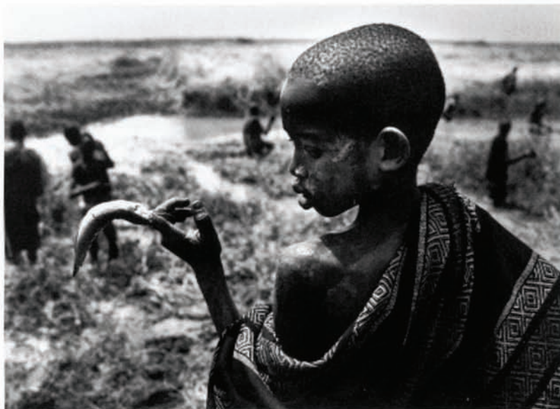
FISHING IN THE MARSHES OF THE GEL CANAL, WHICH IS FILLED WITH WATERS FROM THE NILE RIVER, SOUTHERN SUDAN - 2006