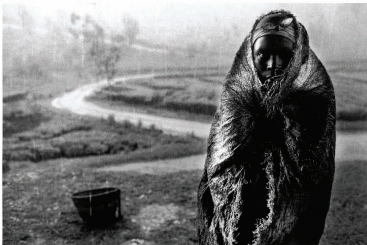
MATA TEA PLANTATION WORKER RWANDA - 1991

Sacan to hold onto cultural traditions in spite of increasing modernization and, in the case of the latter, decades of civil war. He has also photographed extensively in the continent's Great Lakes region, with particular emphasis on the Virunga Mountains, home to a chain of volcanoes and critically endangered gorillas. (These images are part of Salgado's current project, titled Genesis , which chronicles and celebrates the remote places, people and animals of the world untouched by global development.)