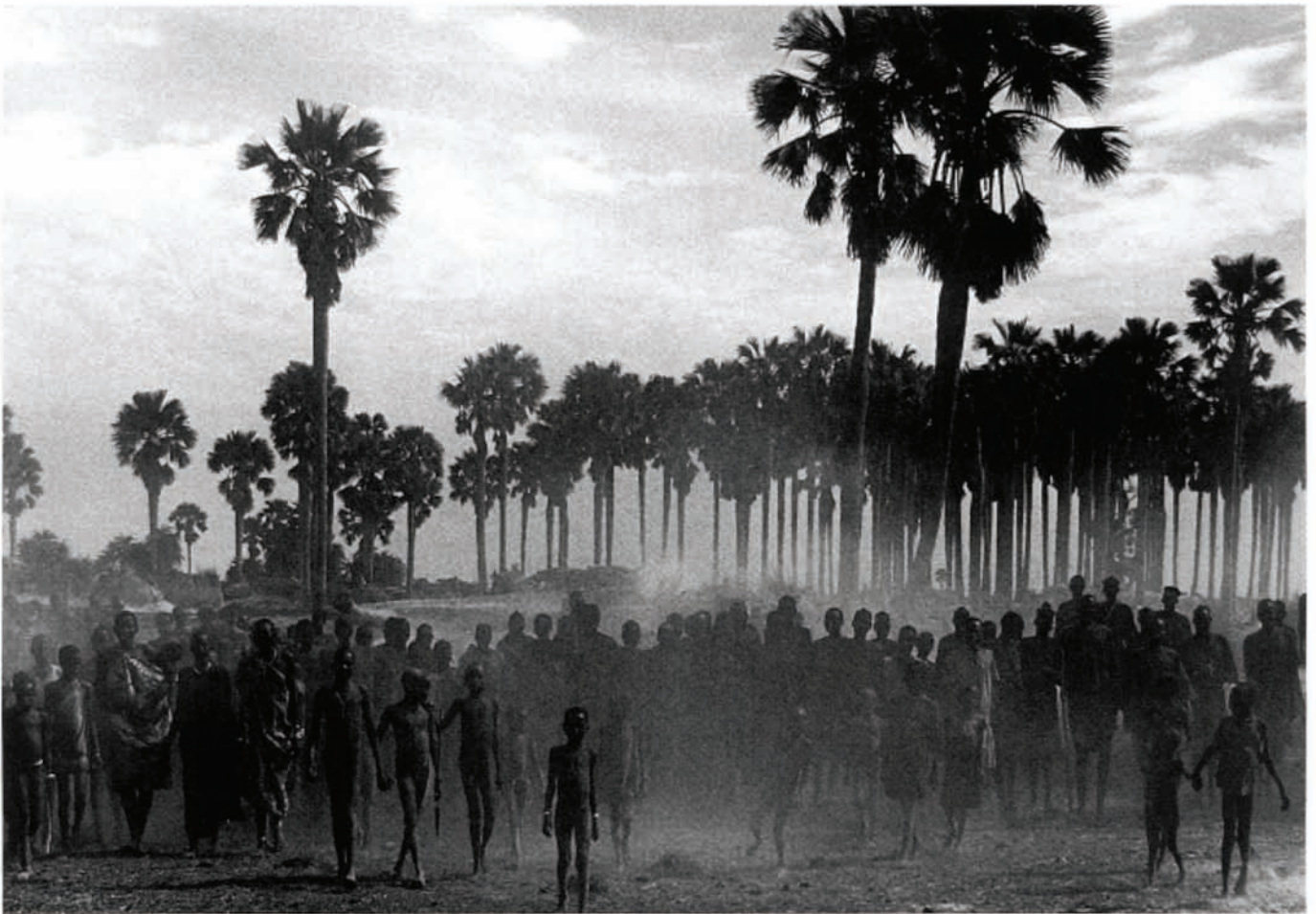
THE POPULATION OF THE CATTLE CAMP OF KENY WALK TOWARD THE POLIO VACCINATORS AS SOON AS THEY ARRIVE MAPER PAYEM AREA, RUMBEK DISTRICT, SOUTHERN SUDAN - 2001