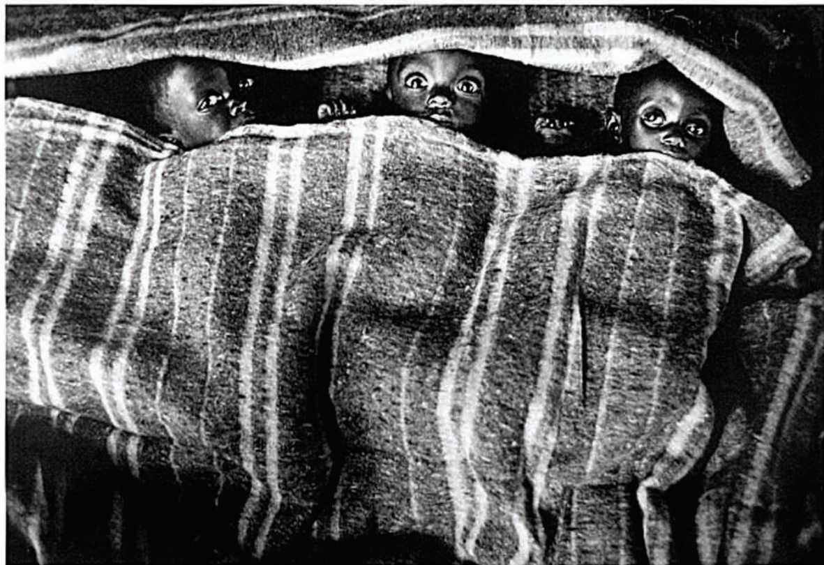
ORPHANAGE ATTACHED TO THE HOSPITAL AT KIBUMBA NUMBER ONE CAMP. GOMA, ZAIRE - 1994

most celebrated projects, Workers (seven years, 23 countries) and Migrations (seven years, 40 countries). Yet it is the continent of Africa, the cradle of humanity, that has laid special claim on his heart and his head; he has produced more than 40 photo essays in various African countries over a period of three decades.