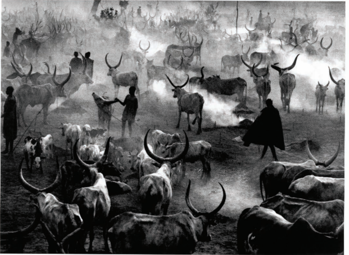
DINKA CATTLE CAMP OF AMAK AT THE END OF THE DAY, WHEN THE HERD IS BACK IN THE CAMP FOR THE NIGHT. THIS IS THE MOST ACTIVE TIME IN THE CAMP, SOUTHERN SUDAN - 2006