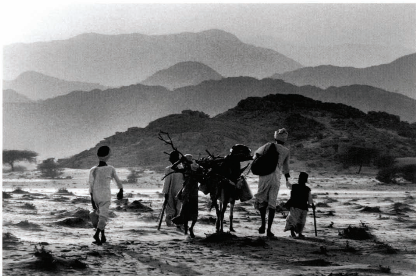
VILLAGERS IN EXODUS BETWEEN TOKAR AND KARORA WALK IN THE HOPE OF REACHING A REFUGEE CAMP. RED SEA REGION, SUDAN - 1985

withered trees and the boy's silhouette emphasize the interdependence between man and environment, even when the relationship turns sour. Another kind of energy is present in the famous image of a mother and child at an Ethiopian refugee camp. Shooting against the light, Salgado has bothed the woman in an ethereal glow redolent of religious iconography. Although seemingly on the point of exhaustion, she radiates eternal perseverance. Salgado himself is not religious, yet such imagery adds another level to the work, another entry point to