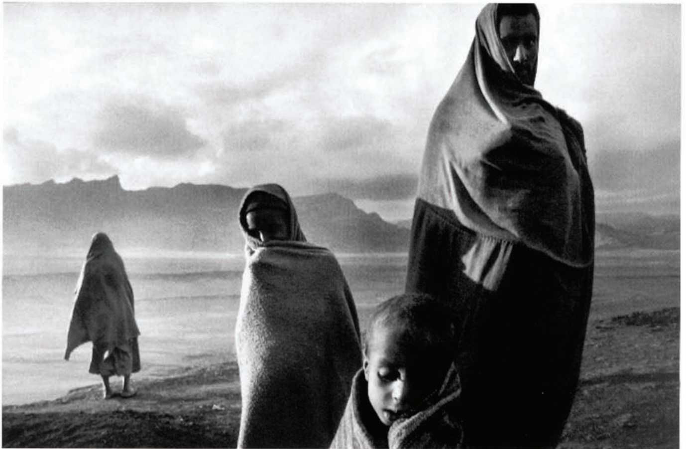
DRAPED IN BLANKETS TO KEEP OUT THE COLD MORNING WIND REFUGEES WAIT OUTSIDE KOREM CAMP ETHIOPIA - 1984