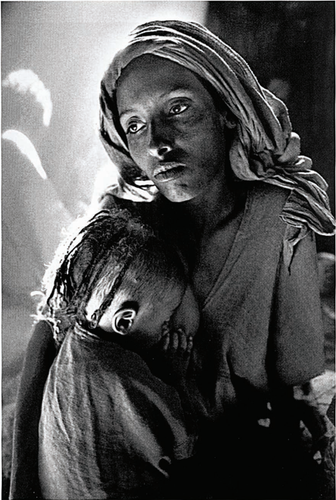
FOOD CENTER RUN BY SAVE THE CHILDREN FUND FOR MOTHERS NURSING THEIR CHILDREN AT KOREM CAMP MOTHER & CHILDREN ETHIOPIA - 1994