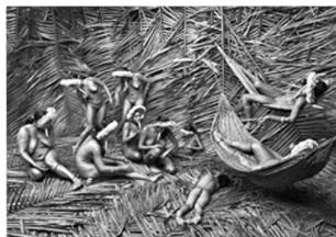
Zo's Group, State of Para, Brazil, 2009.