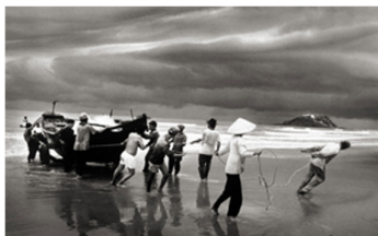
Boat People, Beach of Vung Tau, Vietnam, 1995.