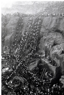
The Gold Mine, Serra Pelada, Brazil, 1986.

The faces and scenes we meet through Sebastiao Salgado's lens are haunting: Indian coffee growers, Vietnamese boatpeople, forgotten landscapes and the impact of globalisation on humankind. Salgado, a Brazilian, has been called the world's most important photographer of the early 21st century. This week his debut solo exhibition in Hong Kong opened at Sundaram Tagore Gallery in Central.