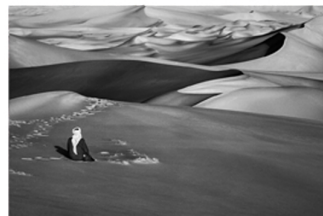
Sahara, Algeria, 2009.