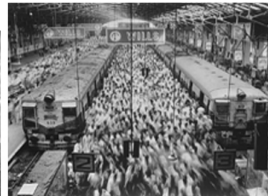
Church Gate Station, Western Railroad Line, Bombay, India, 1995.