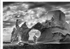
Iceberg Between Paulet Islands and Shetland Islar Antarctica, 2005.