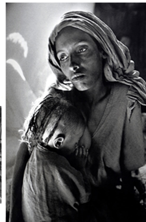
Children's Ward in the Korem Refugee Camp, 1984.