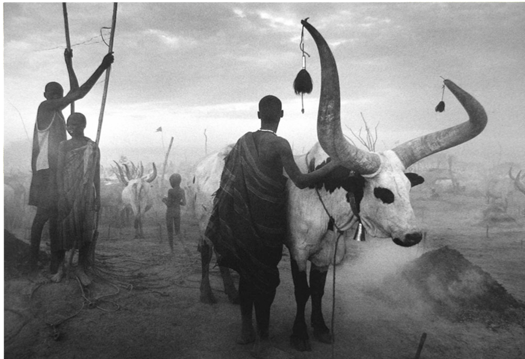
Dinka Group at Pagarau Cattle Camp, 2006.