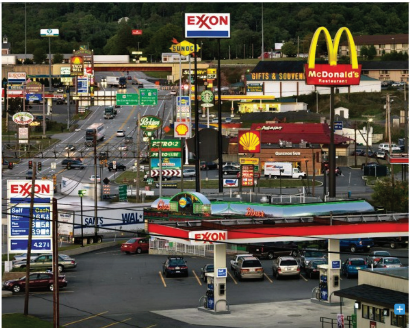
Breezewood Pennsylvania, USA, 2008 / Courtesy of the Artist

EB: I see it in terms of peak oil. It is not a question of if, it is a question of when. Its not like peak oil is going to stop. It's just like the 1974 peak oil problem, it crests and no matter how much you pump it can't keep up with the public demand. All of the sudden you see supply go in one direction and demand go in the other. Then, you get market adjustment; the prices go up to help reduce demand. Its like playing ping pong on a moving train, the price goes up and down, but really its always moving up and going forward. When we average it out, it will move from $100 to $200, $300, $400 per barrel, and that is what it will look like at different price points. As the price goes higher more people will be left behind. Less people will be able to drive, fly in an airplane, and oil consumption will be left for those with more capital, while the rest of us deal with massive inflation. And, third world countries could be completely out of oil, leaving them with huge amounts of social unrest. In countries like China, you can see them purchasing oil fields and natural resources from anyone that will sell, as they know that they don't have many of their own natural resources. They are stock piling from locations around the world in preparation of their expanded development. And, there is going to be a lot of tension globally as we begin to hit peak oil again.