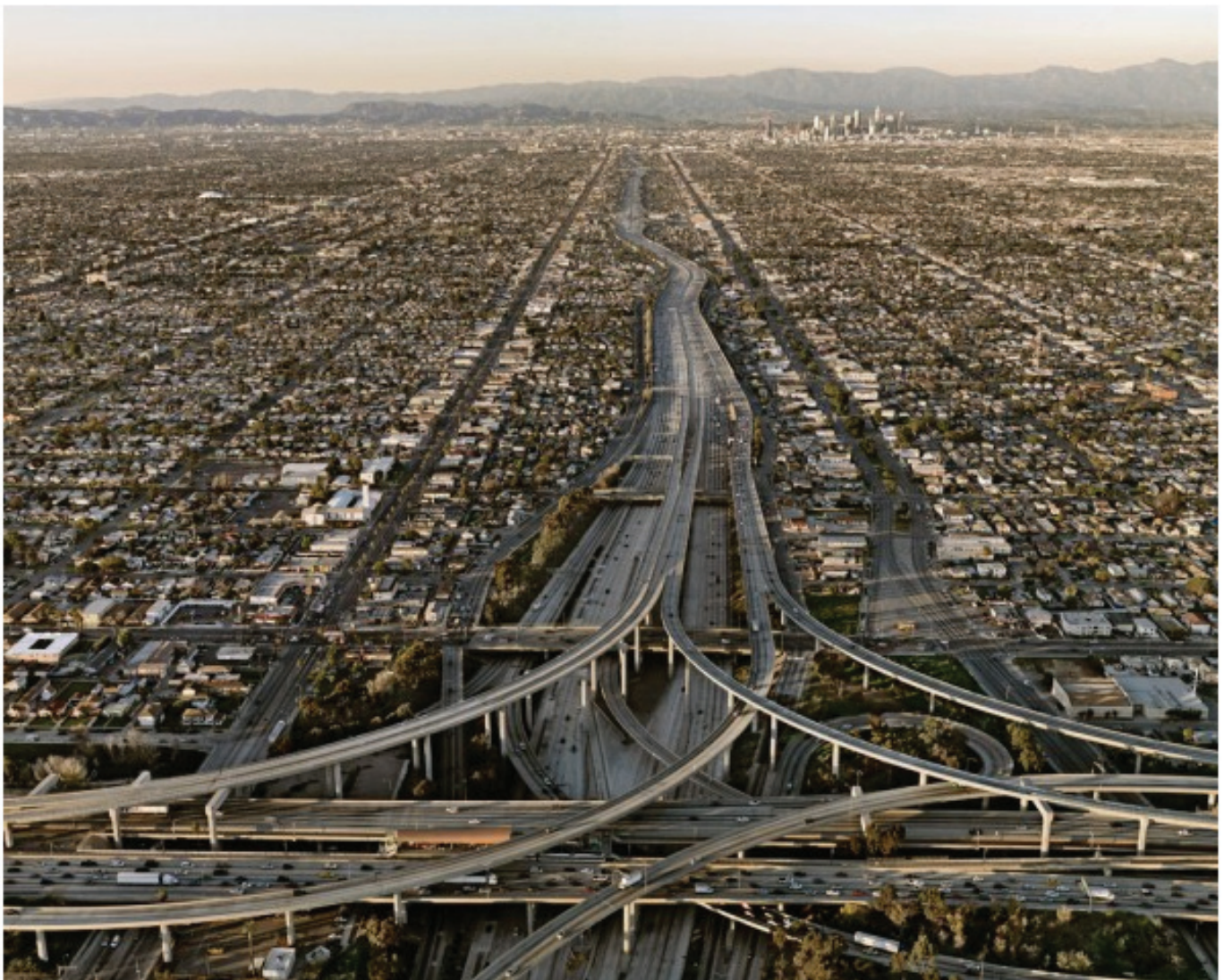
Highway #5 Los Angeles, California, USA, 2009

SC: As an individual, our limited perspective often prohibits us from seeing the larger picture of our impact on the planet. Literally, shifting our perspective to 1000+ feet above the ground can drastically change how we see the world. For me, this was strikingly evident in the expansive aerial photograph Highway #5, Los Angeles, California, USA . Can you talk a little about perspective and access as it relates to your work?