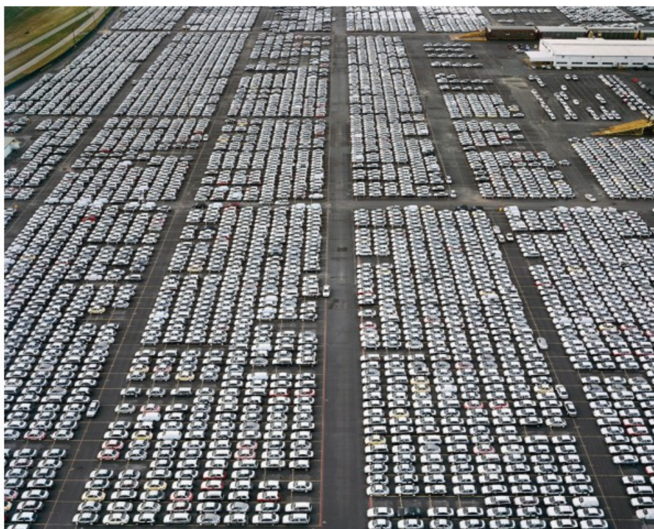
VW Lot #1 Houston, Texas, USA, 2004 / Courtesy of the Artist

SC: There is so many issues with the inevitability of another spill at the magnitude of the gulf oil crisis. But, the western world is so detached from the actual production of oil that it can seem out of touch. We just know that we still need it, and therefore, another site will be built. Another type of technology will be invented to reach another pocket of oil. This brings me to the lanscape pictures that you made under the umbrella of the End of Oil . They are so striking and haunting. These images really get to the essence of not only the impact of our consumption of oil, but also the waste we leave behind. However, we know that now matter how many of these sites are used and abandoned, inevitably another will open to satisfy out needs. So, seeing these images actually makes me consider the future of oil. I'm curious about what your discoveries have led you to think about the future of the man-made world in regard to this material? What do you see on the horizon?