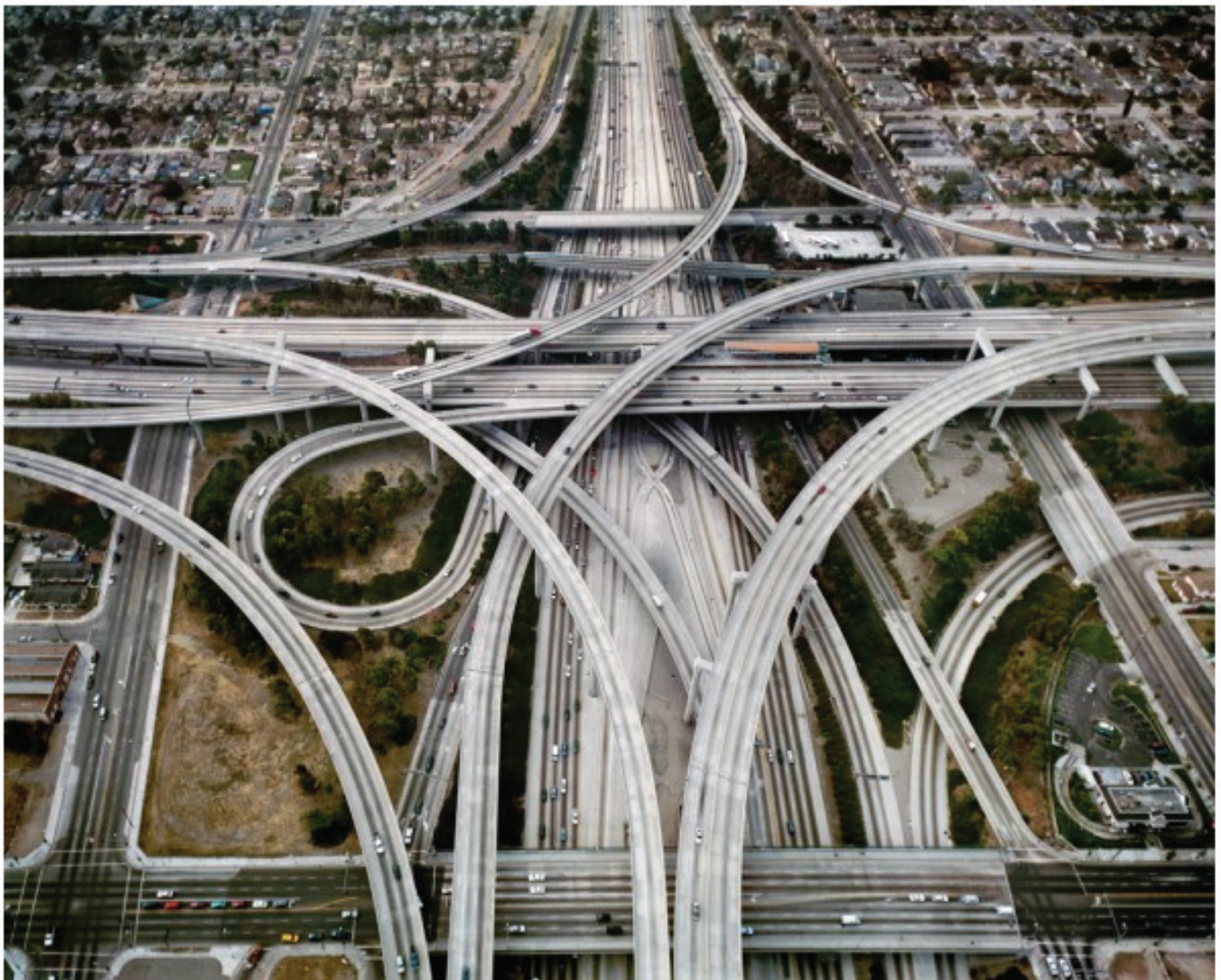
Highway #1 Los Angeles, California, USA, 2003

EB: When you stand at ground level, a real hierarchy begins to form. Everything in the foreground of the picture becomes dominant and hides everything behind it. The middle just becomes irrelevant at eye or ground level. But, then I realized that as you move up a bit, things begin to reveal themselves and you get a real sense of the relationships between the foreground, middle ground, and background. The descriptive power of the elevated point of view becomes so much more interesting than the view from the ground. From this point, you really get the chance to understand the scale of the landscape or how much of something is there, like how many cars are backed up behind you or how many planes are parked together. You get to see and really understand scale from the elevated viewpoint. And for me, that is a way that I can describe the system in which we organize certain things on such a large scale.