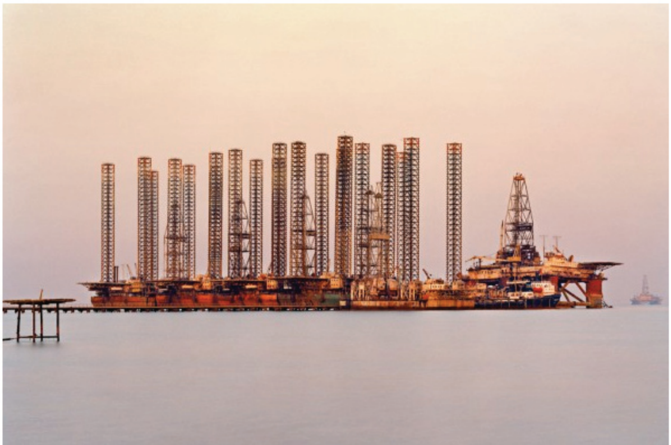
SOCAR Oil Fields #6 Baku, Azerbaijan, 2006 / Courtesy of the Artist

EB: I do believe that an image has to be visually compelling to address the kind of landscape that will challenge us and make us ask the important questions. I think that artists don't really have the power to change the world, but we do have the power to raise questions about the world that we are creating. In my heart, I feel that as artists we can hold a mirror up to society and help reflect upon exactly what we are doing and what type of world we are creating. All types of artists have the ability to take on this task. We must take on society and examine the condition of the human experience, and make sense of it as an individual and as a collective society. You are simply not going to get this type of storytelling directly from science. It is the role of the artist to tell this type of story. It's inherent in the creative arts to reflect where we are going in a way that perhaps has not been thought of before. And, aesthetics is a portal through which people will enter to explore these notions. But, if the work is not visually interesting enough for them to enter, then you won't be able to communicate anything at all to the viewer.