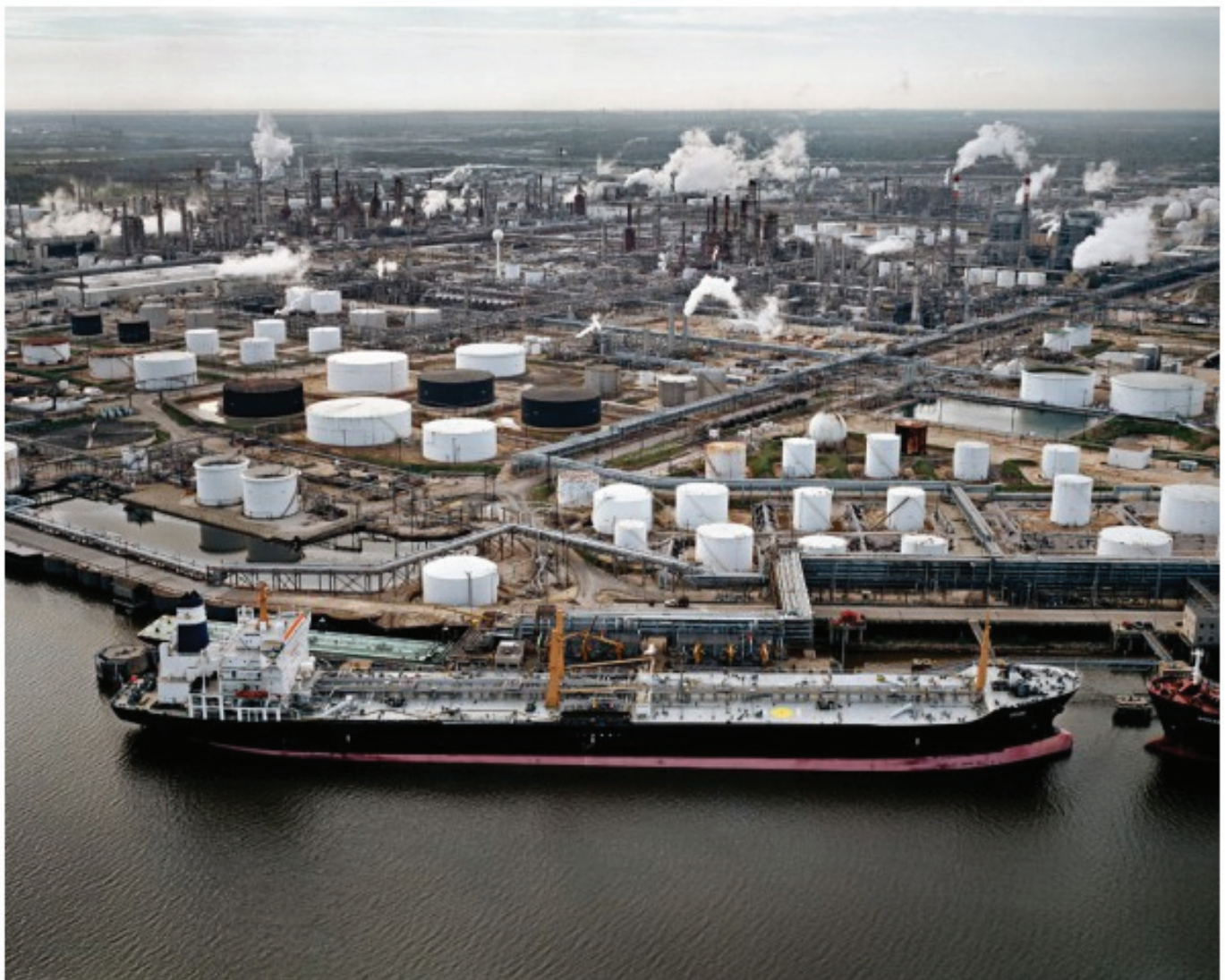
Oil Tanker and Refineries Pasadena, Texas, USA, 2004

SC: Absolutely. The impact is so invisible to the western world. There are such small moments where we can see the effects of our culture on the rest of the earth. This brings to mind the times that we do get to see our actions unfold — like with the gulf oil crisis. Considering that you had been working on this project and related projects for well over a decade when the Gulf oil crisis happened two years ago, what went through your mind when viewing those images and video on TV? What is your reaction to the incident and all that has occurred in that region since?