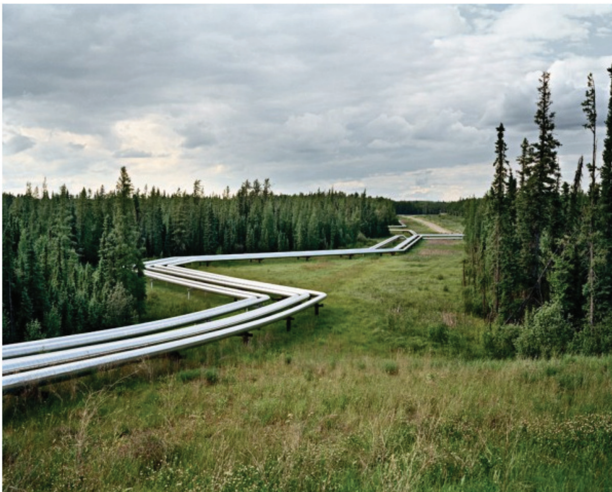
Oil Fields #22 Cold Lake, Alberta, Canada, 2001

These ideas led me to consider the things that are around me, from the fuel in my car to the road that I am driving on, to the plastic container that was in my hand. They are all produced with oil. As I started to look around, I asked myself what's not oil? and that became the more interesting question. It was at that point that I began to close the chapter on mining and open the chapter on the oil landscape. That started my research representing the extraction and refinement of oil, the urban worlds and events produced as a result of oil, and the end of the line — the final entropy and physical result of oil consumption.