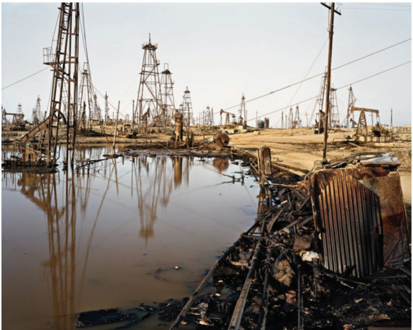
SOCAR Oil Fields #4 Baku, Azerbaijan, 2006