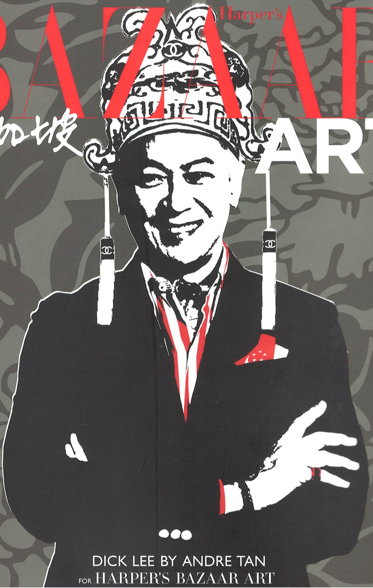
DICK LEE