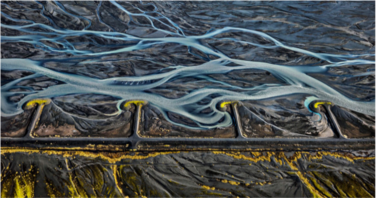
Edward Burtynsky, Markarfljót River #3, Erosion Control, Iceland, 2012, Chromogenic color print, 38 1/8 x 68 inches