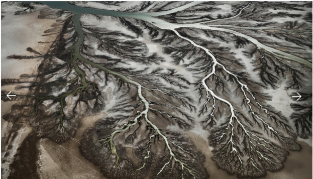
COLORADO RIVER DELTA #1 IN BAJA, MEXICO.