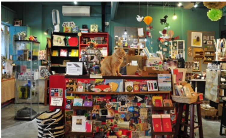
Cat Socrates boutique