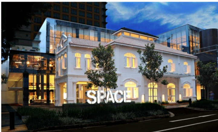
Space, a contemporary furniture store, part of the restored conservation shophouses at Space Asia Hub

Interview by Claire Knox The Guardian, Saturday 15 November 2014