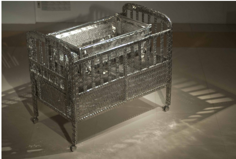
Tayeba Begum Lipi, My Daughter's Cot II , (2012). Stainless steel razor blades . 40 x 28 x 48 in. (101.6 x 71.1 x 122 cm.).

I am satisfied that I have never stopped working and never will until I have used all my energy. I was born in a very simple but culturally vibrant family in the countryside of Bangladesh. In a country such as Bangladesh, when someone aggressively pursues his or her artistic practice without knowing where it will finally anchor, I am blessed that I have made my name as an artist.