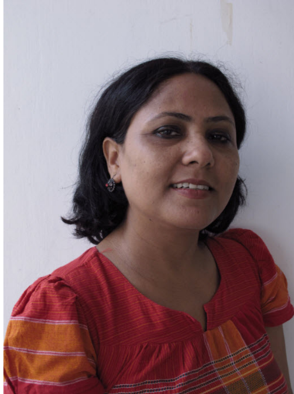
Tayeba Begum Lipi.

Bangladeshi artist Tayeba Begum Lipi works in a variety of media that highlight the violence against women in her country, while also showcasing their fortitude. In her sculptural works, Lipi often uses stainless steel razor blades as a reference to the dangerous practices used during childbirth in less developed regions. One such example was Let's Take a Break , a bathtub constructed from razor blades in her recent group show at Sundaram Tagore Gallery . The artist looks to her past for inspiration, and exhibits the pain she shares with women who have suffered.