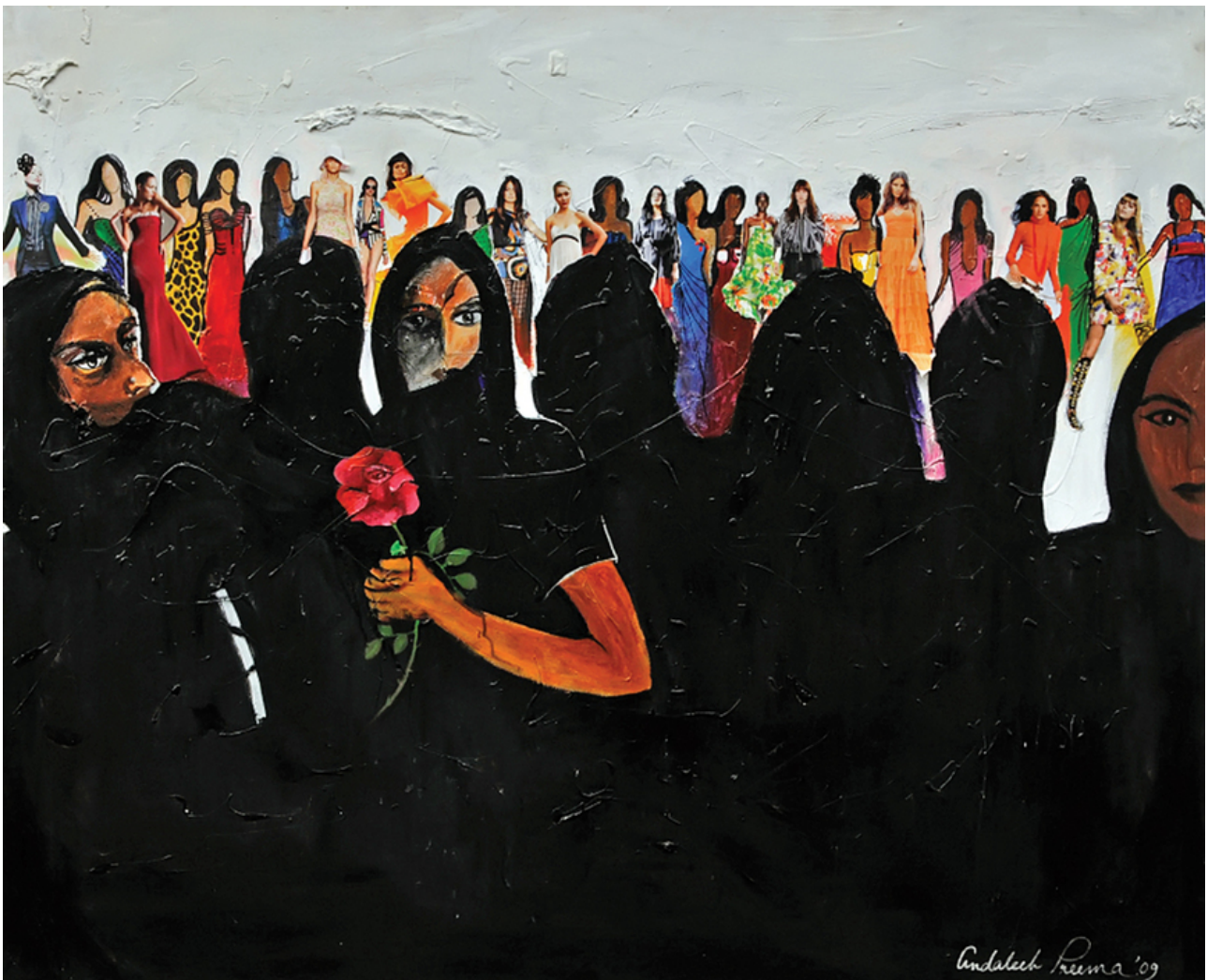
NAZIA ANDALEEB PREEMA, Cosmopolitan , 2009, mixed media on canvas, 122 × 153 cm.

The artist is also known—in certain circles, infamous—for her female nudes. In 2012, Preema was marooned in her hotel room one rainy day in Paris. There she produced a series of drawings of provocatively posed nude women, several of which subsequently inspired oil