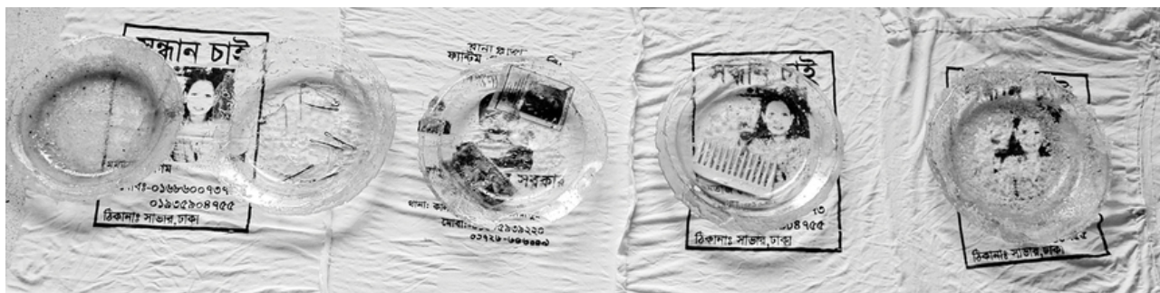
DILARA BEGUM JOLLY, installation view of the series "Object," 2014, resin and found objects, dimensions variable.

Jolly's next series, "Tader Bola" ("Their Words") (2008), depicts female reproductive organs as if they were stitched in nakshi kanthas , or Bengali embroidered quilts. As a child Jolly sat with her female relatives who gossiped and shared their trials as they embroidered—hence, the title of the series. Paradoxes of pain and domesticity, the stitches are a link to the artist's ancestors and other Bengali women. Reminiscent of the traditional female-made textiles in Chicago's The Dinner Party (1979), kantha embroidery also provided Jolly with nonacademic formal influences that have historically been produced by women. In several drawings and paintings, such as those in "Tader Bola," Jolly represents stitches through precise, regularly placed dots, lines and dashes. Tader Bola 4 (2008) is a delicate yellow and crimson composition executed with crosshatches evocative of embroidery, in which a lotus-like ovary is punctuated by women's heads, mapping matrilineal descent. A lotus bulb with eyes for seeds emerges from the ovary, recalling a placenta. Jolly borrows from kantha imagery, in which lotuses signify fertility and endurance as they are known to emerge from village ponds and survive the dry season.