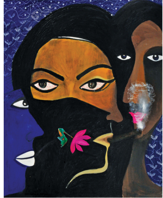
NAZIA ANDALEEB PREEMA, Desire , 2009, mixed media on canvas, 153 × 122 cm.

in Cosmopolitan (2009), titled after the women's magazine that offers sex, dating, fashion and career advice. The canvas offers contrasting planes of light and primary colors and black, evocative of its subjects' tensions. In the middle ground a phalanx of riotously hued supermodels cut from the pages of Cosmo strut aggressively toward a line of women in burqas, their faces half shadowed, in the foreground. One of the women meets our gaze. Her head is veiled, but her arm is exposed—the metamorphosis has begun. The woman clutches a rose, a symbol of both the passion and the lojja she is compelled to safeguard. The figure's eyes are wide, one eyebrow cocked in alarm. What will happen when the two worlds meet?