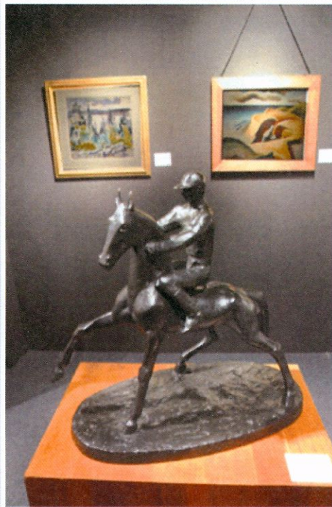
The Hunt Diederich bronze "The Jockey" was $95,000 at Gerald Peters Gallery, New York City. The John Marin watercolor, rear left, was $130,000, while the Thomas Hart Benton oil on canvas double-sided painting, "Seascape, Martha's Vineyard" and "Abstract Landscape," both circa 1920, was $475,000.