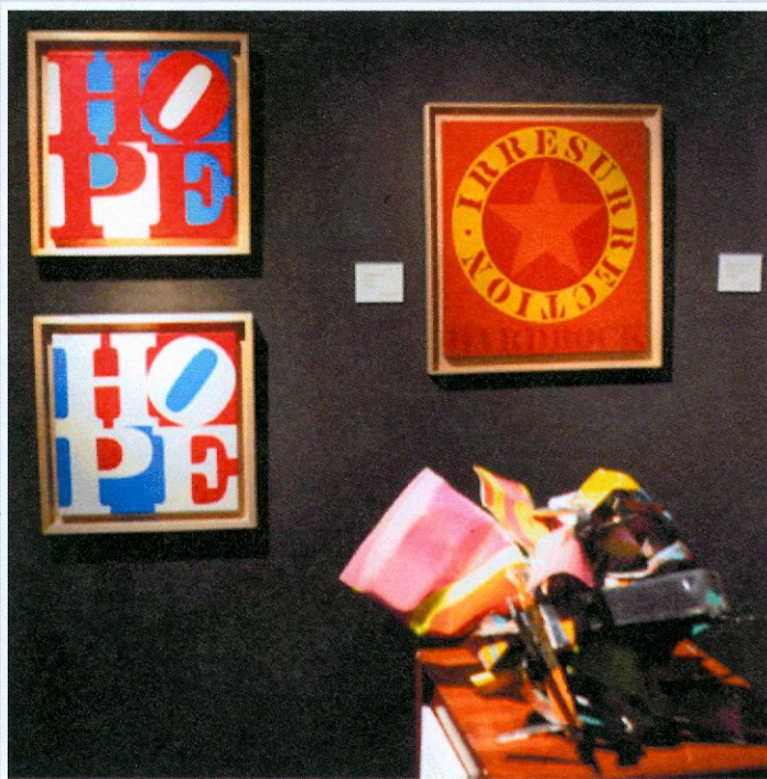
Oils by Robert Indiana and sculpture by John Chamberlain were at Mark Borghi Fine Art, New York City.

Artistic reflections on the campaign appeared at Mark Borghi Fine Art, which displayed two new pieces by Robert Indiana titled "Hope." Similar in form to the stacked "Love" icons of the 1960s, they were from the series that culminated in the stainless steel sculpture that was displayed outside of the Pepsi Center in Denver during the Democratic National Convention.