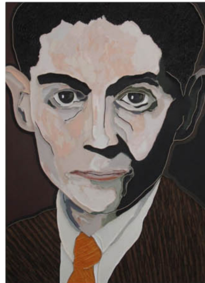
Kafka with Orange Tie, 2009, Acrylic on wood on canvas, 48 x 36 inches

Waisler's work aims to achieve a likeness that reflects the life of the subject, the way in which life has formed and deformed them. These are paintings of human beings that remind us how a single individual can bring about change in society.