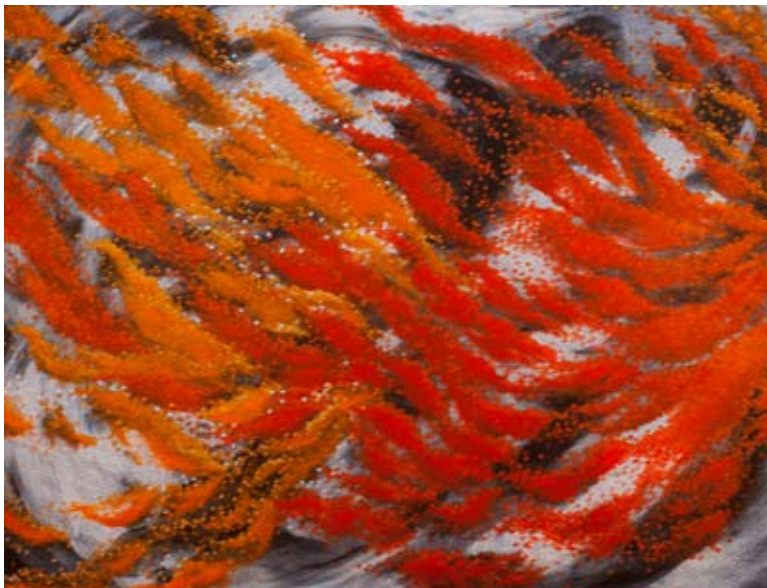
Left: MI , 2011, acrylic on canvas, 48 x 63 inches

Opening cocktail reception: Thursday, January 24, 6 - 8 pm