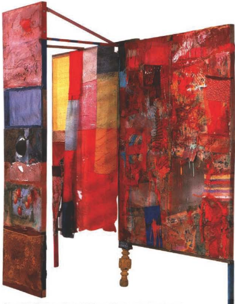
This page: Robert Rauschenberg, Minutiae, 1954, oil, paper, fabric, newspaper, wood, metal, mirror, and stiring on wood, 84% x 81 x 30 ½". Opposite page: Robert Rauschenberg (left) and Brice Marden in the kitchen of Rauschenbergs Lateptete Street studie), New York, 1958.

and Little King cartoons, old photographs, and fragments of posters obscured by painted passages cover the surface. A patchwork of colored fabric swatches bridges the two back panels, attached only on the top, so that the dancers could enter and exit through the curtained opening.