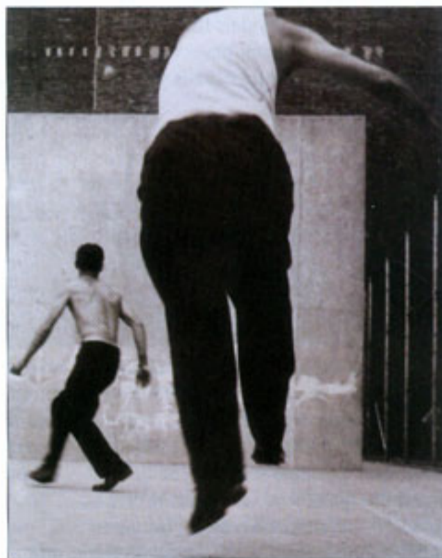
Leon Levinstein, Handball Players, Lower East Side, NY , 1950s–'60s, gelatin silver print, 12 1/4" x 10 1/2". Metropolitan Museum of Art.

another, a hipster perfects his coiffure, unaware of the photographer checking him out from behind. Men parade satyr-like with hulking shoulders and skinny pants in the '60s, and with bellbottoms in