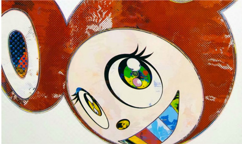
© Takashi Murakami/Kaikai Kiki Co., Ltd. All Rights Reserved. Courtesy Galerie Perrotin Takashi Murakami's "And Then x 6 (Red Dots: The Superflat Method)" sold for US$550,000 at Galerie Perrotin.