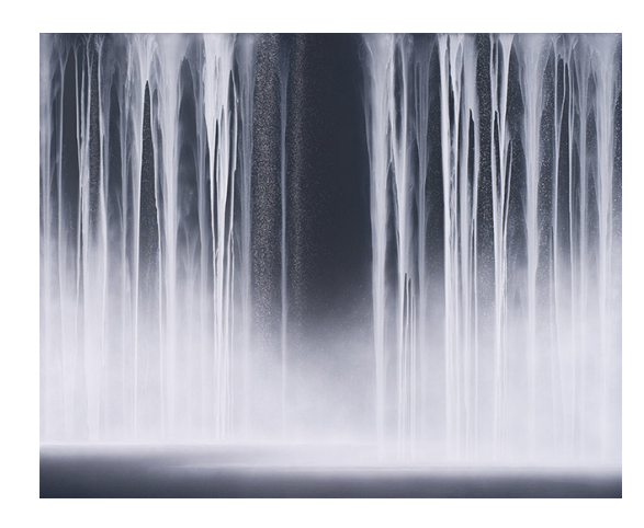
Hiroshi Senju Waterfall: Day, 2014 Sundaram Tagore Gallery