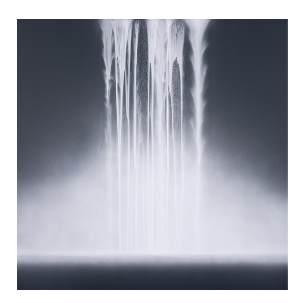
Hiroshi Senju Waterfall: Day, 2014 Sundaram Tagore Gallery