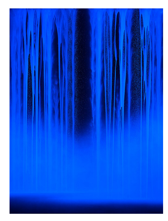
Hiroshi Senju Waterfall: Night, 2014 Sundaram Tagore Gallery