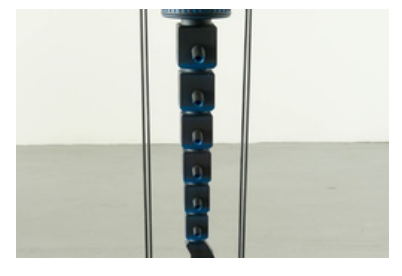
The Future is Always Tomorrow in Micah Ganske's Cityscapes ARTSY EDITORIAL