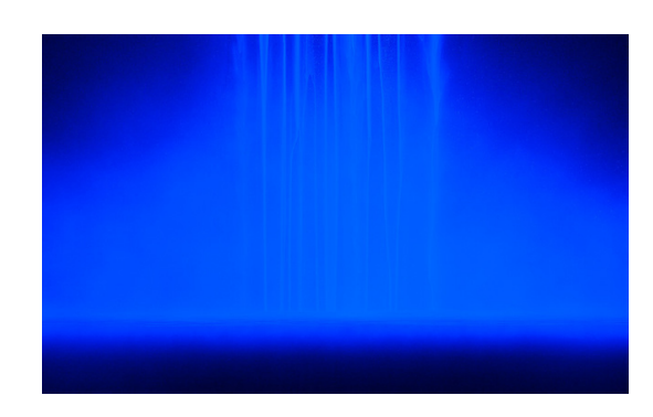
Hiroshi Senju Waterfall: Night, 2014 Sundaram Tagore Gallery