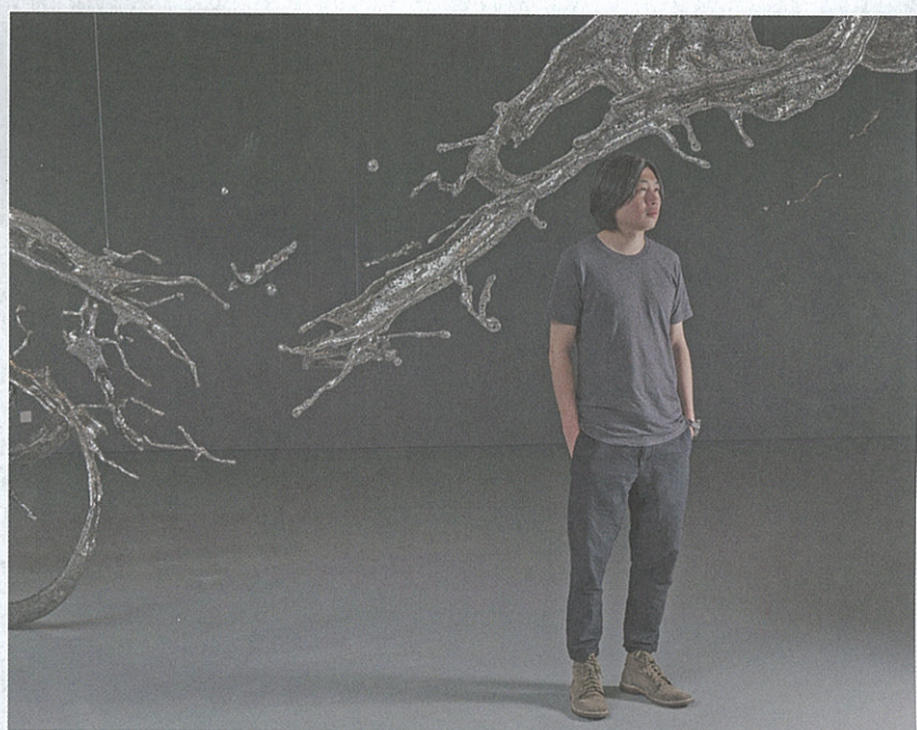
The artist, Zheng Lu

thousands of Chinese characters, which are laser-cut to stainless steel and then hand-welded together in a fashion similar to making chainmail. The interlocking forms are then molded into dynamic compositions according to a cast. Finally, the welded joints are sanded down and polished.