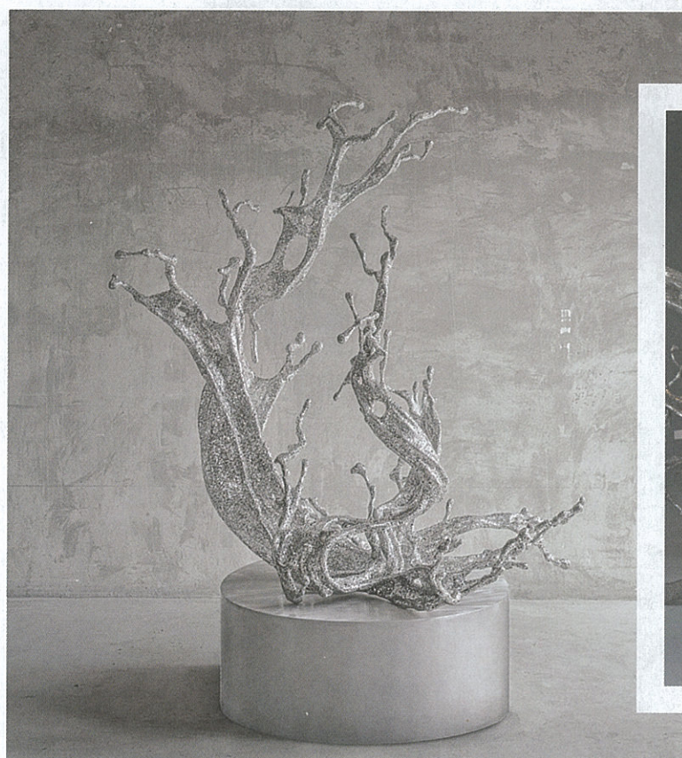
"Water in Dripping — Leisurely," 2014

This series was my brainchild, born when I was pursuing the Master of Fine Arts degree in sculpture at the Central Academy of Fine Arts, Beijing. It was an extension of my thought process during the final project of my Bachelor's years. I have been deeply interested in Chinese calligraphy and transcribing poetry since I was young, and wished to