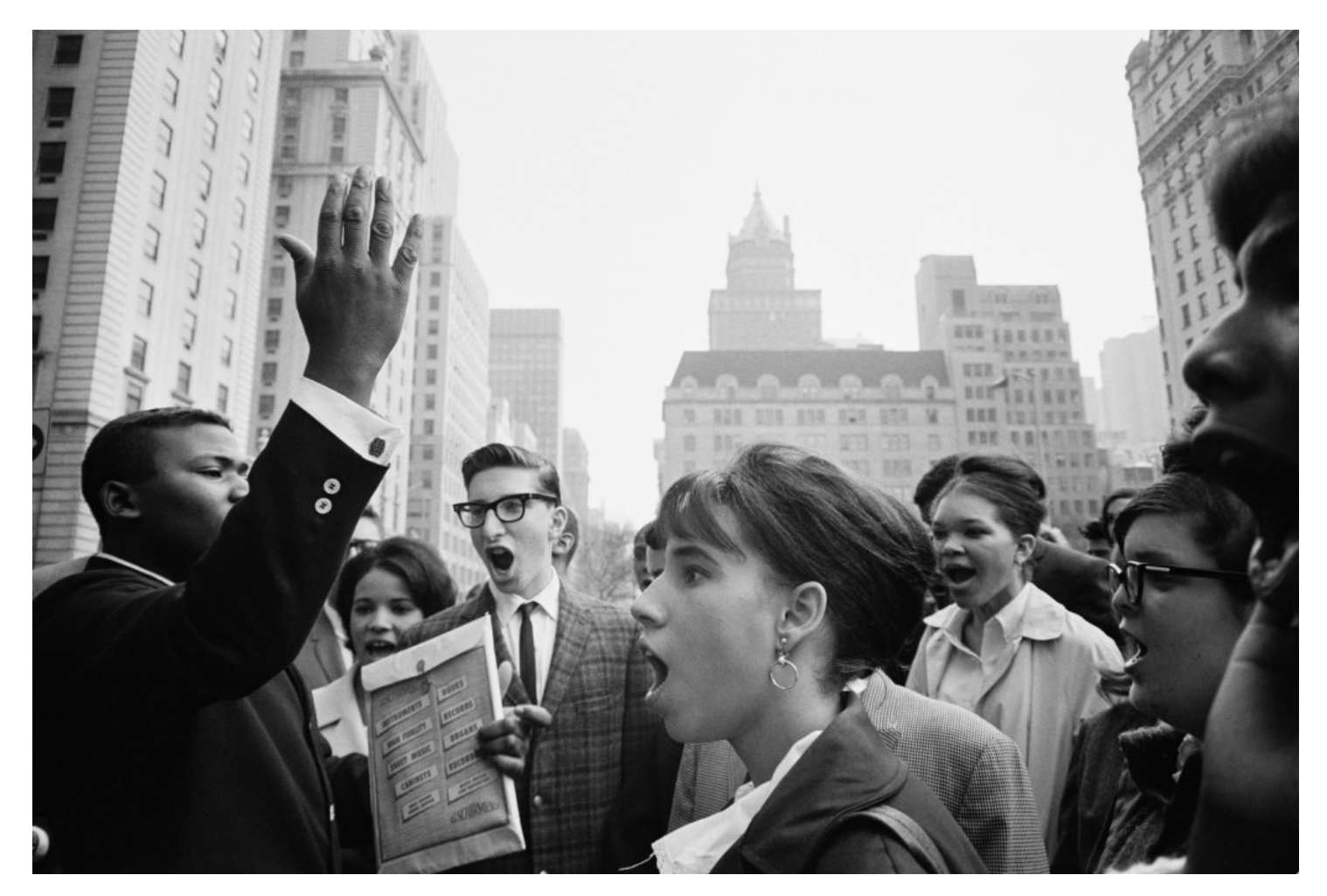
Hiroji Kubota, Anti-Vietnam War gathering, New York, 1964

Possibly for the first time in over 20 years, an exhibition of renowned Magnum photographer Hiroji Kubota's works is being held in Singapore. Made possible in part by sponsorship from Canon, the exhibition features more than one hundred rare prints of the photographer's iconic images, and will be available for viewing until 16 July 2017. Be sure to check it out.