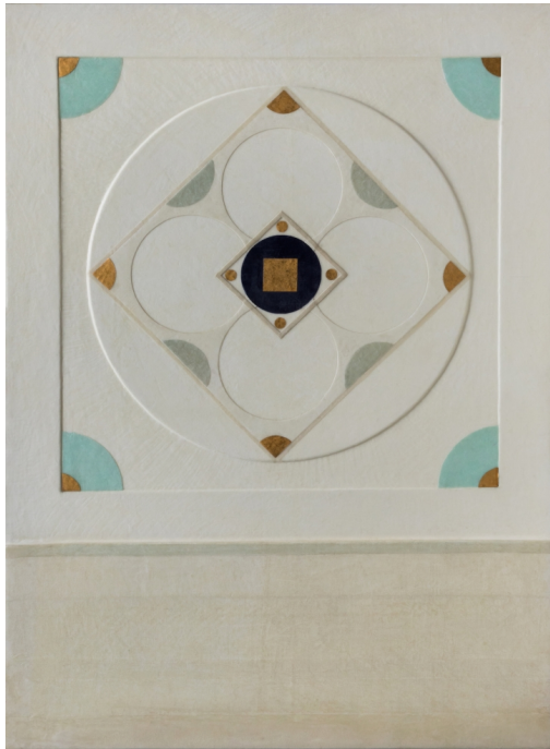
Olivia Munroe, Untitled , 2016, cloth, beeswax, gesso, gold, paper board, rag mat board, 44 x 32 inches

the contemporary French poet Franck André Jammé's book, Tantra Song: Tantric Painting from Rajasthan .