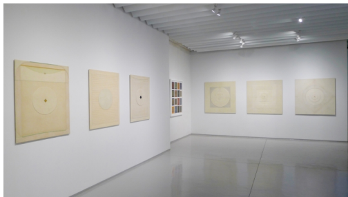
Mixed-media works in Olivia Munroe's current solo exhibition, "Archetypes," in New York

If secrets and uncertainties lurk in the shadows, do truths about what is real and knowable reveal themselves, inevitably, in the light? If, as Buddhist teachings advise, perceived "reality" is merely a fleeting confluence of energies in a moment of infinite time, then what is there that is ever convincingly in our grasp — to be clutched in the hand, held in the mind, or squirreled away