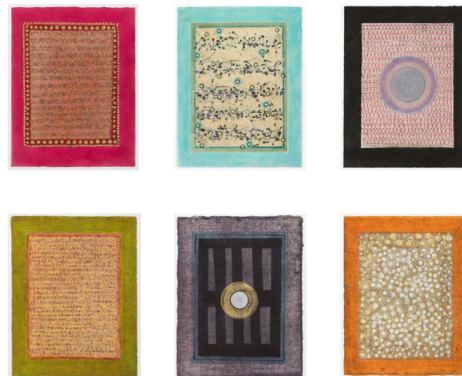
Olivia Munroe, untitled drawings from the "Histories" series, 2012-17, various media on antique paper, each piece 7.5 x 10 inches

Such abstract images — a small triangle and a circle plunked down in empty pictorial space like lonely islands in a vast sea, or a block of bold, Daniel Burin-like stripes — serve as visual prompts for a seeker's deep, concentrated, spiritual contemplation. Similarly, the character of Munroe's art also brings to mind that of the pioneer in abstraction Hilma af Klint (1862-1944), a Swedish mystic whose paintings predated the non-realist, image-making experiments of such legendary early modernists as Wassily Kandinsky or Piet Mondrian.