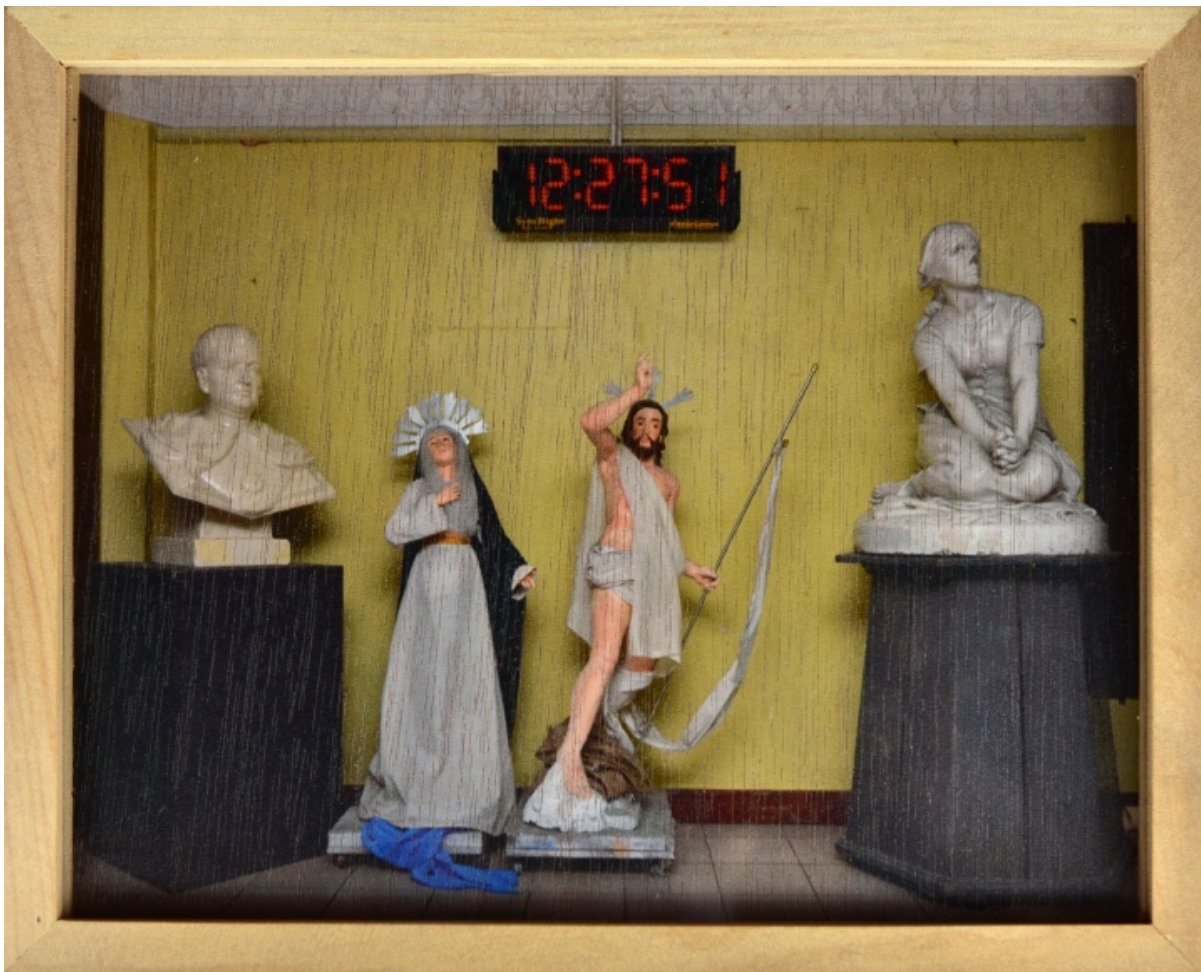
'In the belief that' by Mm Yu, 2006 – 2015, 22 framed prints on wood

within the space. When you enter, you see that “welcome” sculpture (chuckles) then you see this three-channel video work with the last screen showing an abstracted cityscape, which then leads to the first billboard frame, which to me also refers to the city. In the beginning [of the exhibition], it is quite monochromatic with basic elements like wood, rust, and metal and then it slowly transitions to colour. But in all the works, even in the colored ones, there is still an element of grime, of earth or mud. I like this feeling of roughness and greasiness that permeates everything.