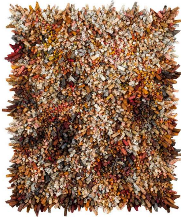
Chun Kwang Young, Aggregation 17 - NV093, 2017, mixed media with Korean mulberry paper, 73.2 x 60.2 inches/186 x 153 cm

Chun Kwang Young at Sundaram Tagore Gallery