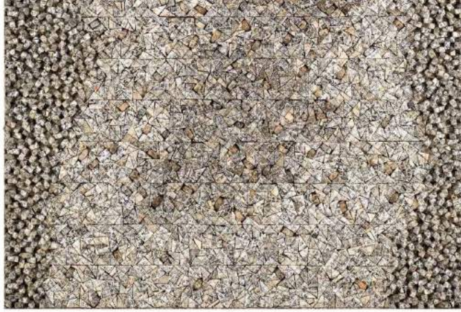
Chun Kwang Young, Aggregation 00 - NV306 , 2000, mixed media with Korean mulberry paper, 64.6 x 52 inches/164 x 132 cm ©Image courtesy of the artist

Other works are hung more traditionally on the wall. Yet even in pieces like Aggregation 13 – AUO38 , the geological, Styrofoam forms break the boundaries of the rectangular canvas and push both horizontally toward the viewer and vertically beyond the boundary of their frame. The titles themselves, with their identifying numbers, suggest images that one would expect to have been produced by NASA, and they evoke a certain process of cataloguing and exploration, as though the viewer were traversing at once a moonscape, a mountain-scape or even a cityscape. This otherworldliness gives to the Aggregation series a kind of universal appeal, not bound to a specific culture, but still informed by it.