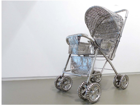
“The Stolen Dream” (2013), Stainless steel made razor blades, 27.5 x 20 x 37 inches, image courtesy of Sundaram Tagore Gallery