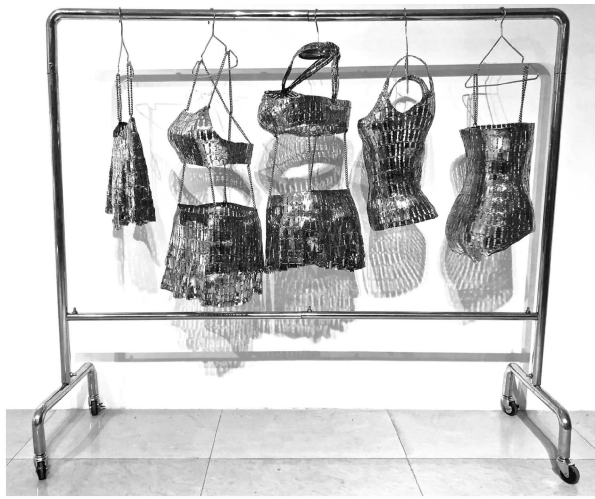
“The Rack I Remember” (2019), Stainless steel razor blades and stainless steel, dimensions vary photo by Mahbubur Rahman, courtesy of Sundaram Tagore Gallery