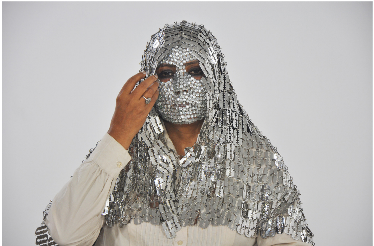
Still from Unveiling Womanhood (2017), video installation