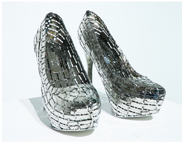
“Not For Me 2” (2018), Stainless steel razor blades, 8 x 9 x 6 inches, photo by Mahbubur Rahman, image courtesy of Sundaram Tagore Gallery