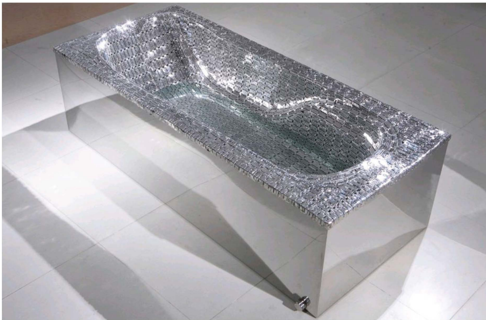
“Let’s Take a Break” (2013), Stainless steel made razor blades, stainless steel sheet and water, 64.2 x 28.3 x 18.5 inches