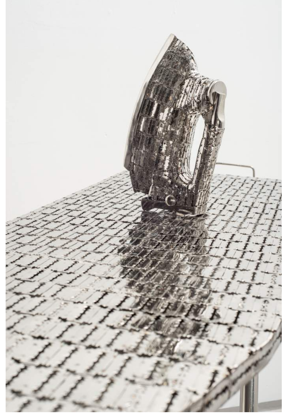
Photo Caption: Tayeba Begum Lipi, Together, 2018, stainless steel, 43x57x14 inches