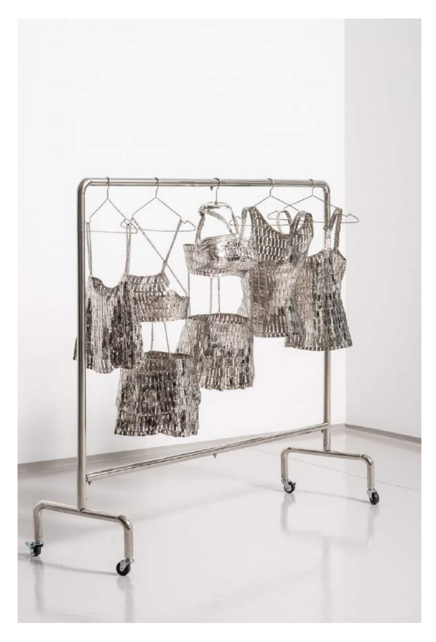
Photo Caption: Tayeba Begum Lipi, The Rack I Remember, 2019, stainless steel and razor blades