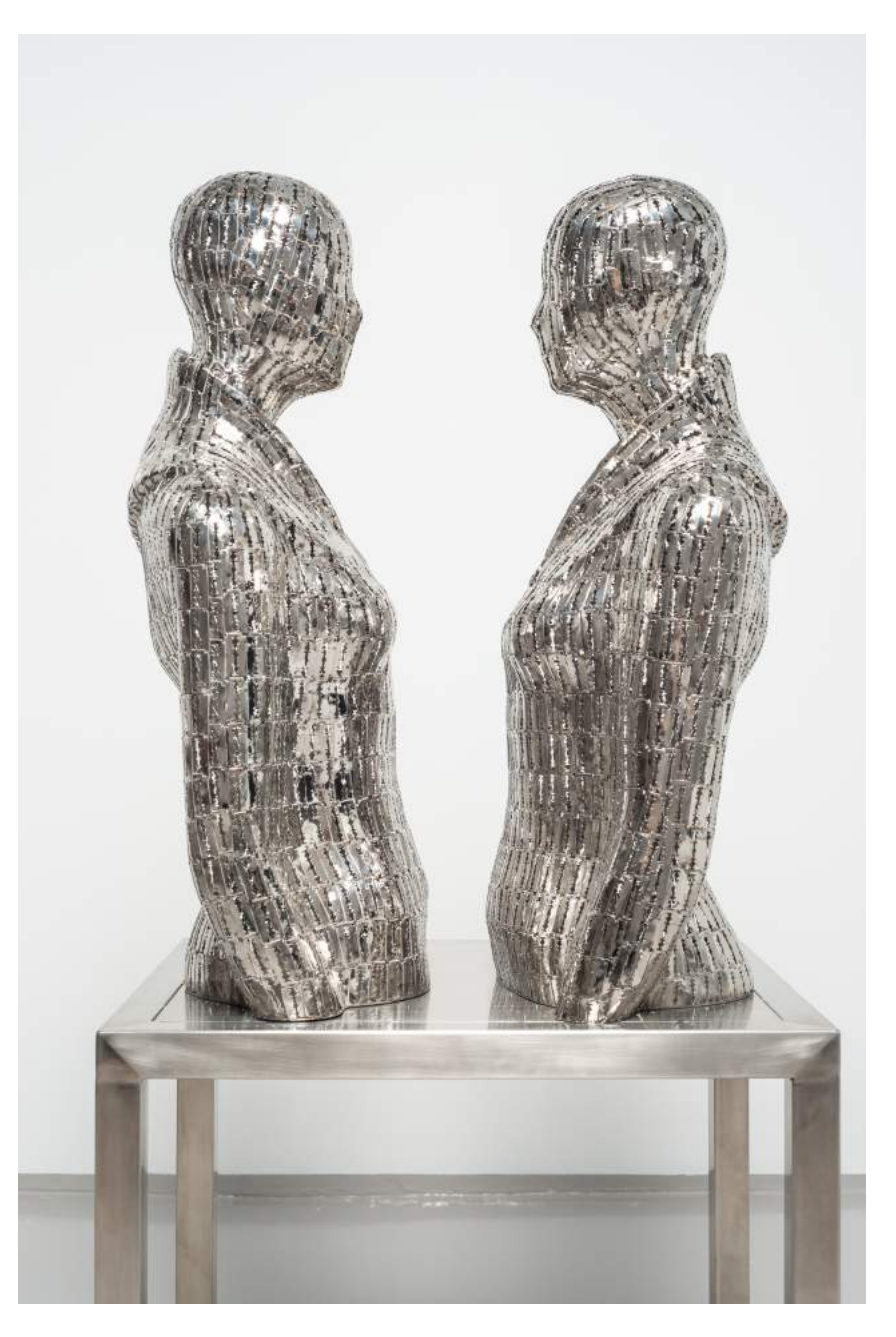
Photo Caption: Tayeba Begum Lipi, Mirror, 2017, stainless steel, 48x24x16.7 inches | Photo courtesy of Sundaram Tagore Gallery