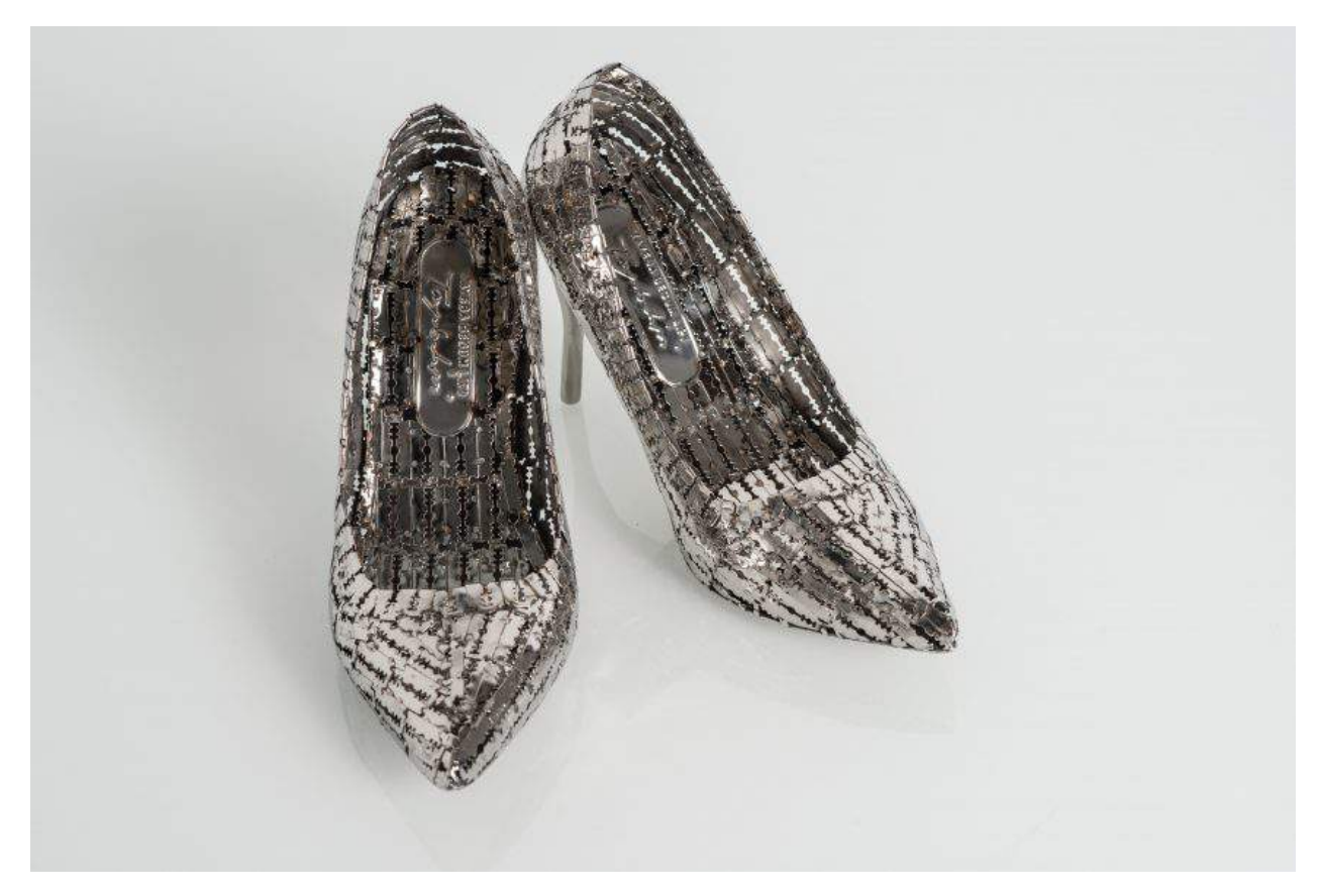
Photo Caption: Tayeba Begum Lipi, 'Not For Me,' 2019, stainless steel, 7x10x 6 inches