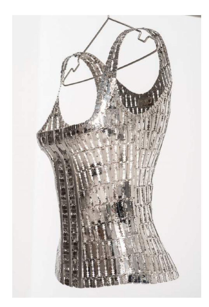
Photo Caption: Tayeba Begum Lipi, The Tank Top, 2019, stainless steel, 22x12x6 inches