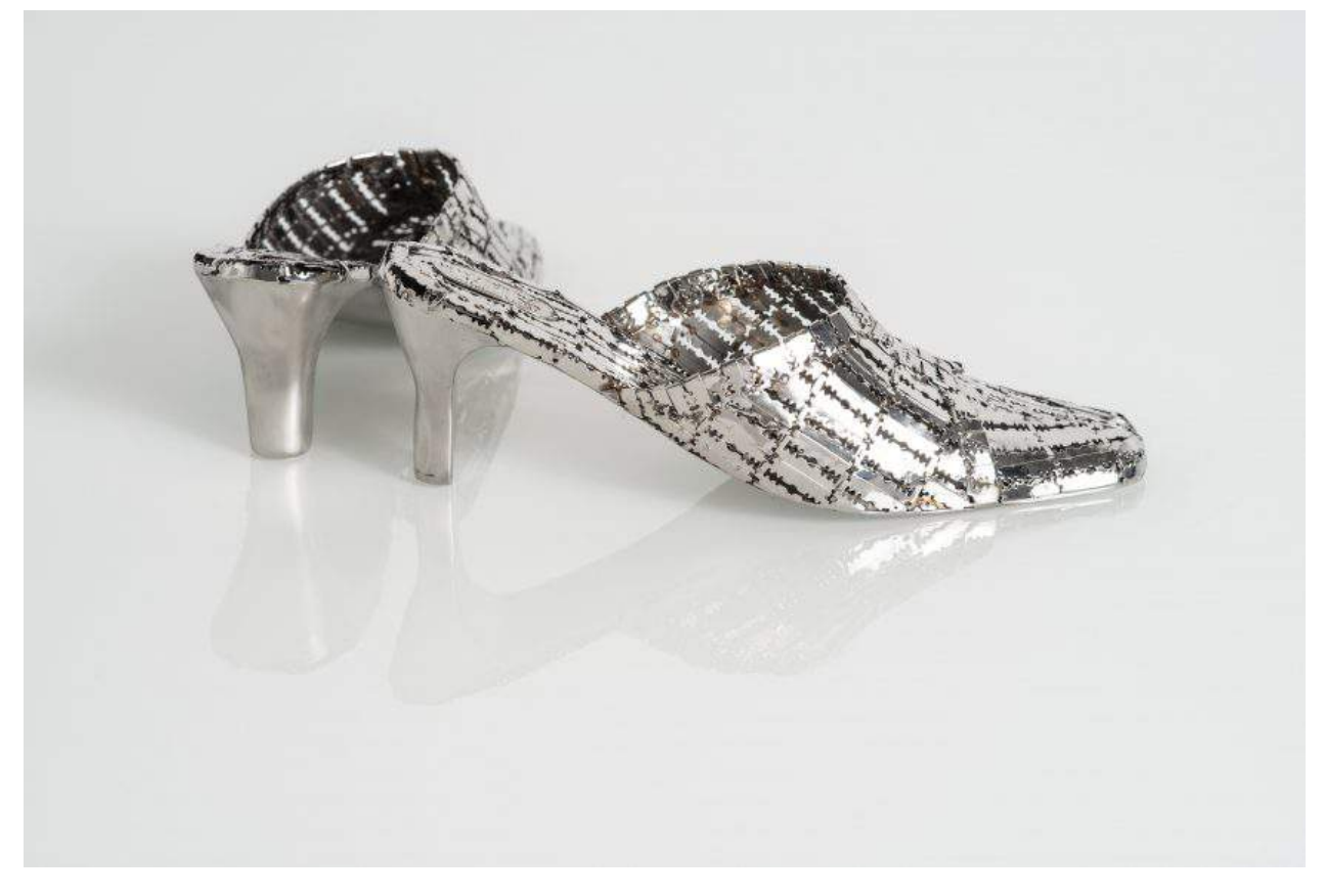
Photo Caption: Tayeba Begum Lipi, The Italian Black Heels, 2019, stainless steel, 6x10x8 inches