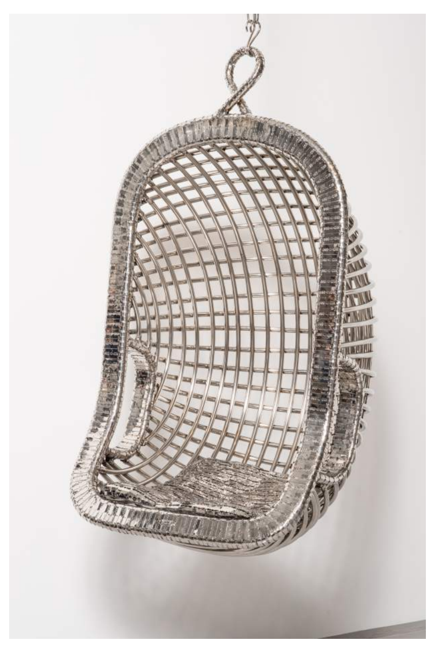
Photo Caption: Tayeba Begum Lipi, The Swing, 2017, stainless steel, 46x24x24 inches