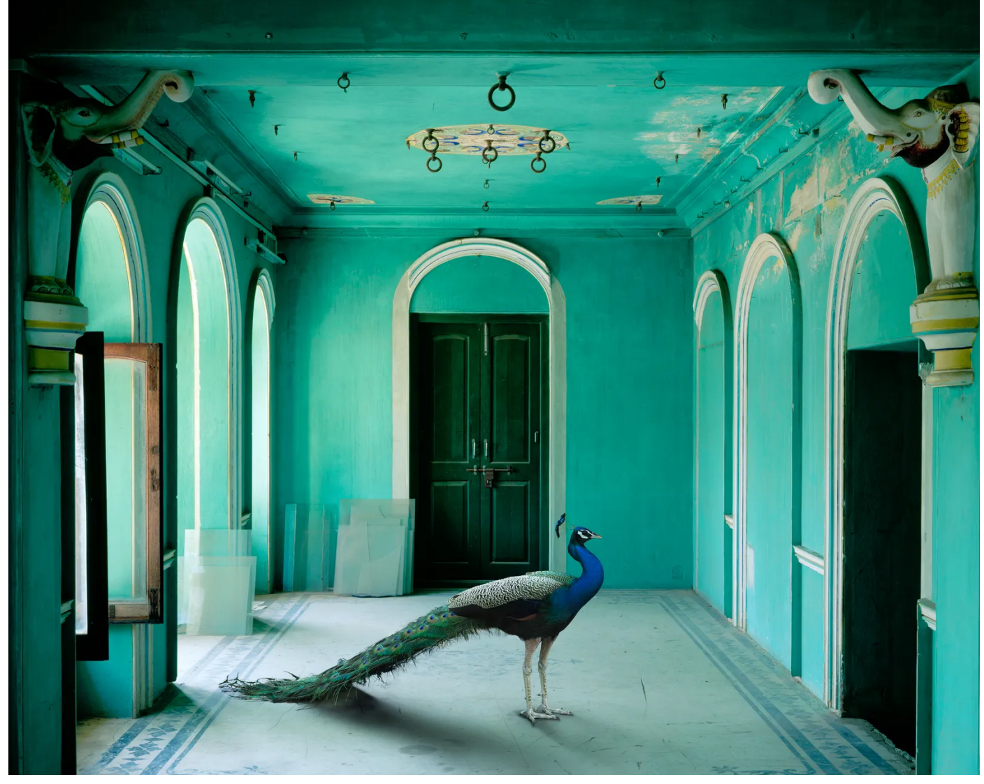
The Queen's Room, Zanana, Udaipur City by Karen Knorr

In her London-based practice, Knorr examines the meaning of place, drawing from ancient myths and allegories. 'The Queen's Room', Zenana, Udaipur City Palace, 2010 is a heady jade tinted room with a handsome peacock while 'Faithful Companion' at Samode Palace is an image that hints at reincarnation. Knorr employs grand interior spaces of palaces, temples and museums across Asia and Western Europe to frame issues of gender and class rooted in cultural heritage.