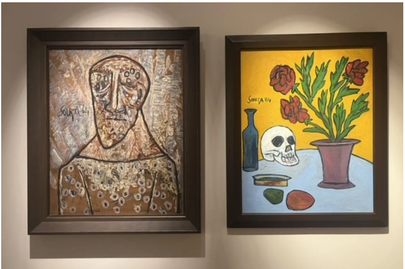
Works of F. N. Souza on display at Masterpiece London

Also read: This evocative new exhibition in London brings together South Asia's greatest modern artists