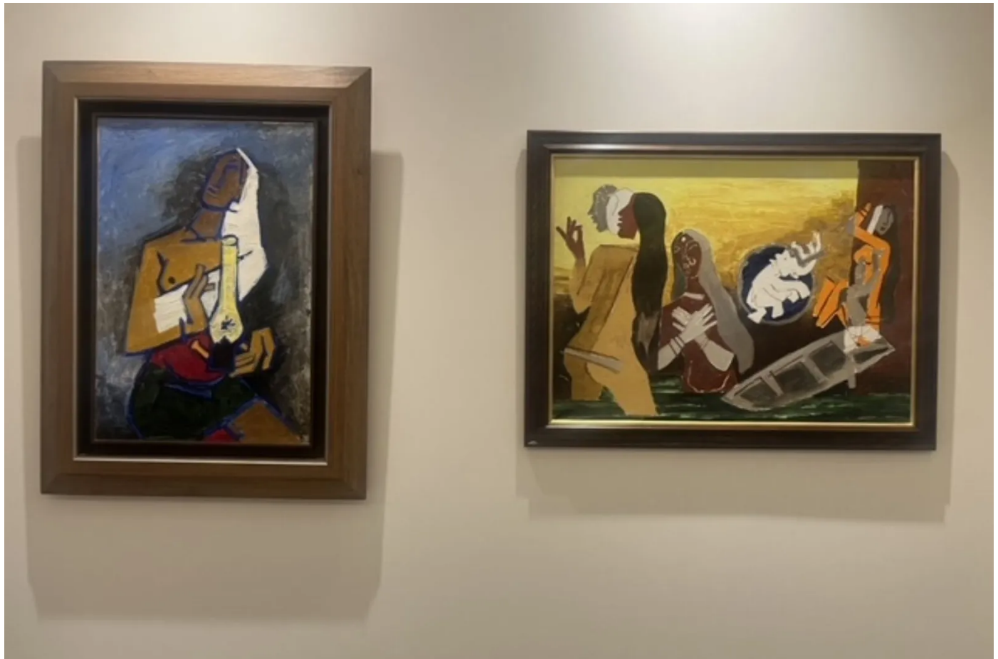
Works of M.F. Husain on display at Masterpiece London

Souza's daring treatment of the human figure and bold use of colours make his works intriguing to look at at the Dhoomimal booth. Additionally, M.F Hussain's vibrant narratives reflect 20 th century Western norms, but have their unique artistic vocabulary that flaunt thick strokes of paint exuding intense emotion and vigour. The beauty of Masterpiece London is that it gives galleries such as Dhoomimal a platform to bring the finest of Indian art to the world stage. Jain adds, "A lot of overseas guests really liked what they saw, especially the bird tree series by Swaminathan, the landscapes of Gade, and Souza's dynamic works. However, they did not have any context of these artists. Indian art definitely needs to be shown more internationally for people to gain context and perspective."