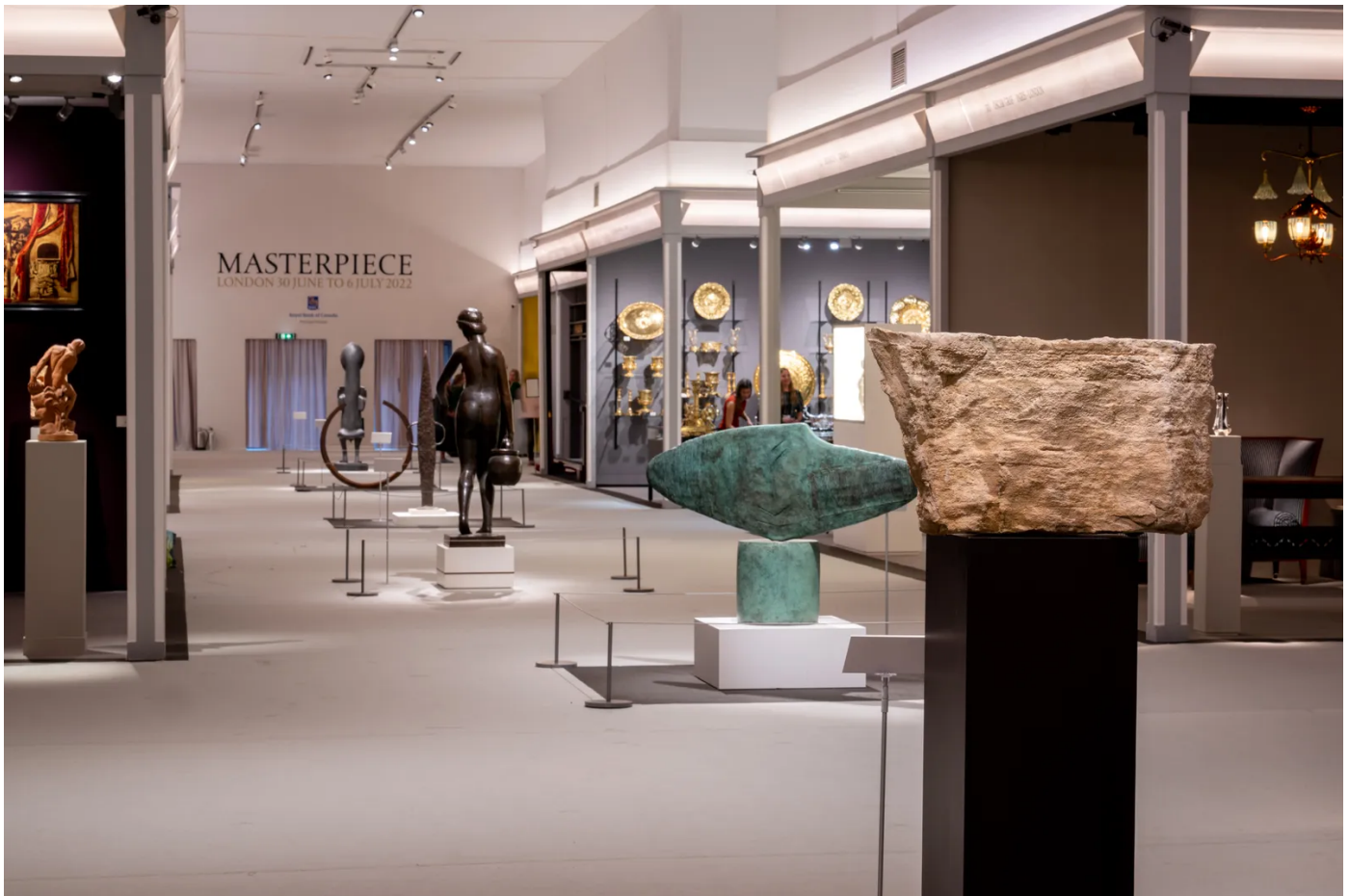
Aisle view at Masterpiece London

This year, the dynamic displays at Masterpiece include the likes of antique furniture, a Colombian emerald by Moussaieff, and a skull of a Triceratops dinosaur from over 60 million years ago. Arian Alan, one of the leading dealers in 19 th century furniture, are displaying a large Louis XV style gilt, and a bronze-and-crystal-cut chandelier.