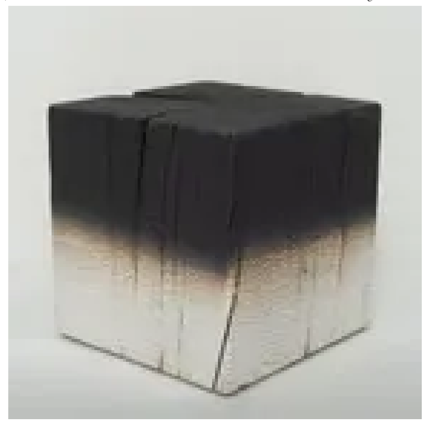
January 22, 2021, Matsu Pine Shou Sugi Ban Silver by Miya Ando

In a block of charred cedar wood that Ando has placed in her sculptural installations, we can see time in its rings, and beauty in its materiality. In its charred outside, we its impermanence, and also the contradiction that a charred piece of wood is more fireproof than a living tree. At the same time, in the silver nitrate coating we see reflections of ourselves.