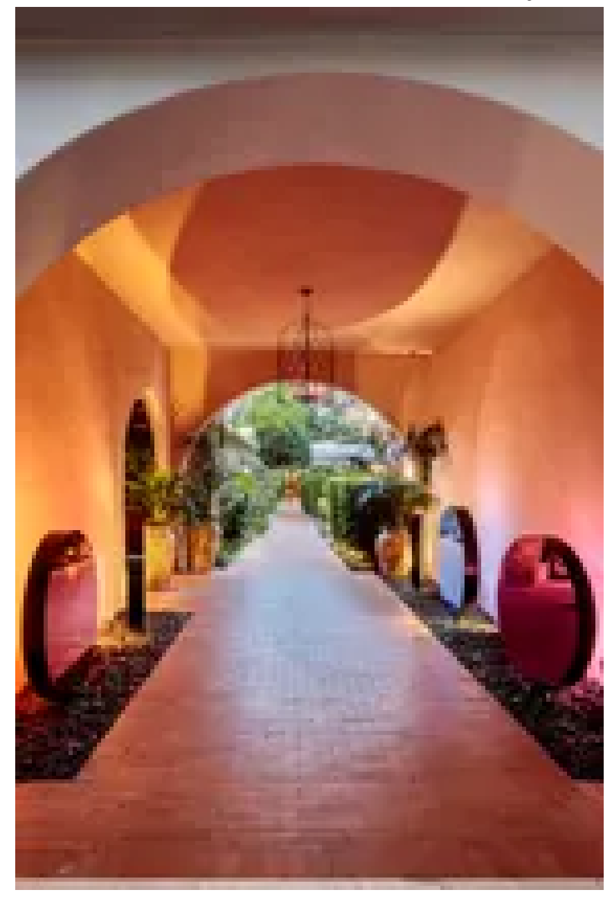
Installation view of Spectral Radiance by Shana Maberi at Hotel Bel Air

Shana Mabari's installation features a set of colorful disks arrayed on both sides of a path to the dining area. They are low to the ground and at first you might not even realize they are artworks. But then as you are in the midst of them, their reflective surface and colors refract the landscape, the people passing by, and each other. At first, the discs seem almost weightless, impossibly balanced and floating above the