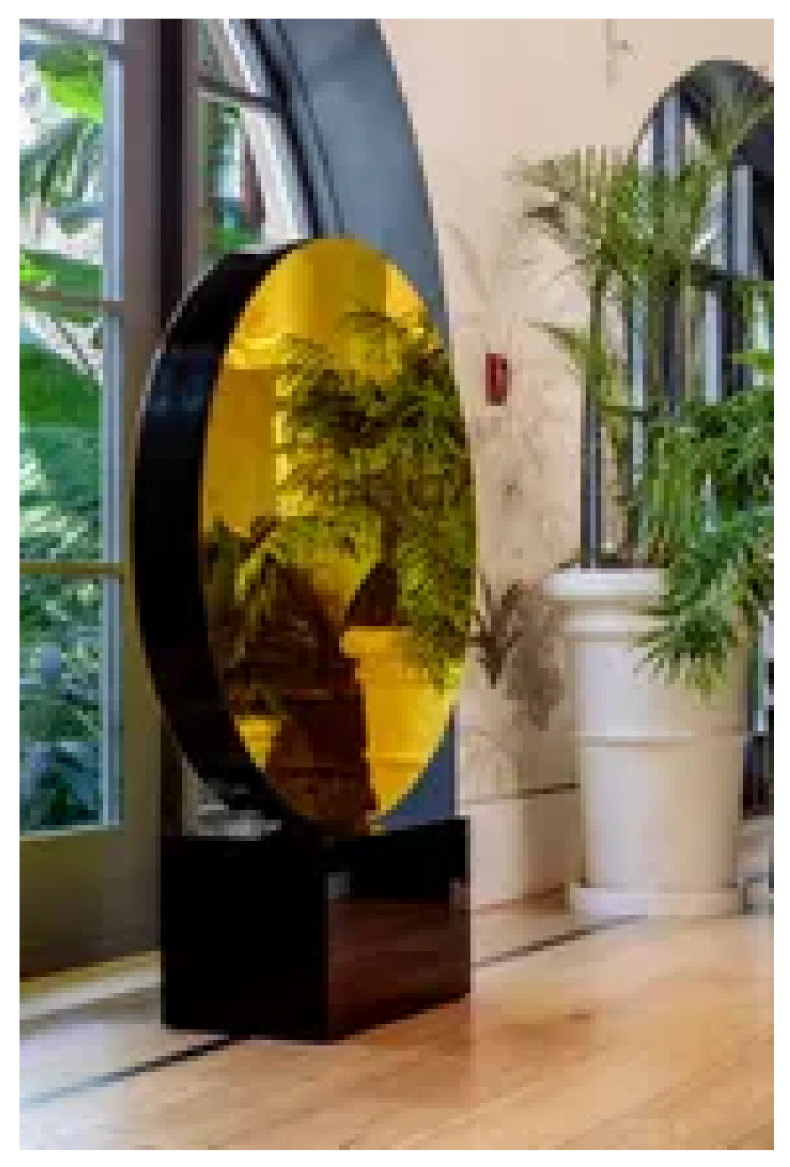
Installation view of Spectral Radiance by Shana Mahari at Hotel Rel Ai

Mabari's discs are certainly works of art but they are also feats of science and engineering, recalling the California Light and Space movement.