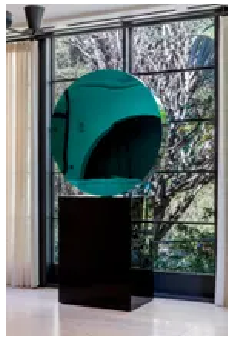
Installation view Spectral Radiance by Shana Mabari

There are two more new works placed in the reception area and its adjacent living room-like space. The disc in the reception area caught me by surprise. It sits on a pedestal several feet off the ground and so large that it seems like a religious or meditative object, whose size disappears as its color field envelops you.