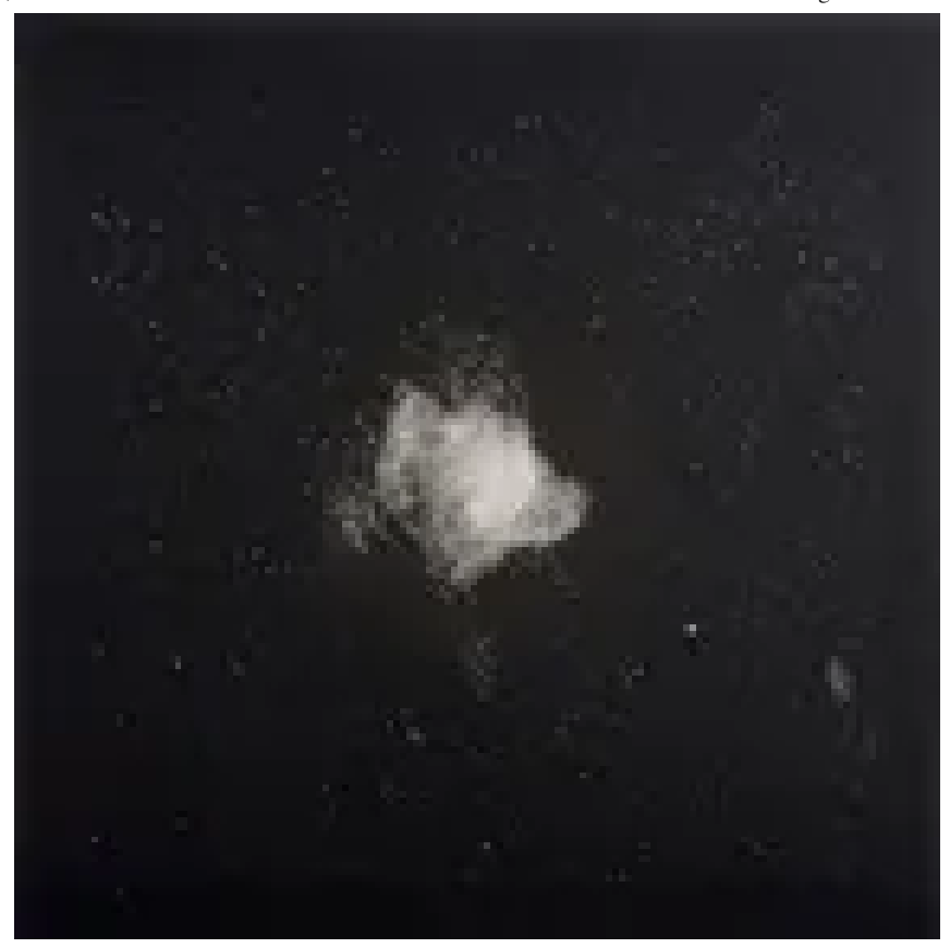
Galaxy 10 by Mia Ando

There are also four photographic prints on exhibit, exposures made using black paper and powdered silver, part of a series about the Milky Way, or as it is referred to in Japan, the Silver River in Heaven. These are part of a suite of 24 images based on an ancient Japanese agricultural calendar (made up of 24 micro-seasons).