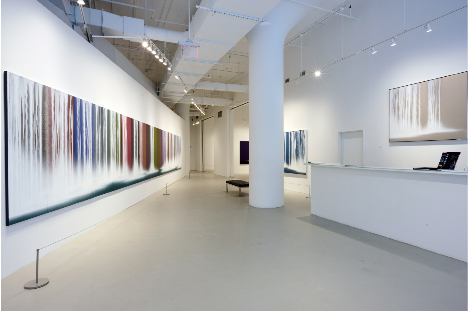
Paintings by Hiroshi Senju.

Divided into Dayfall/Nightfall spaces, the gallery transforms into a fully immersive installation. A wall divides the vast Chelsea space into two experiences.