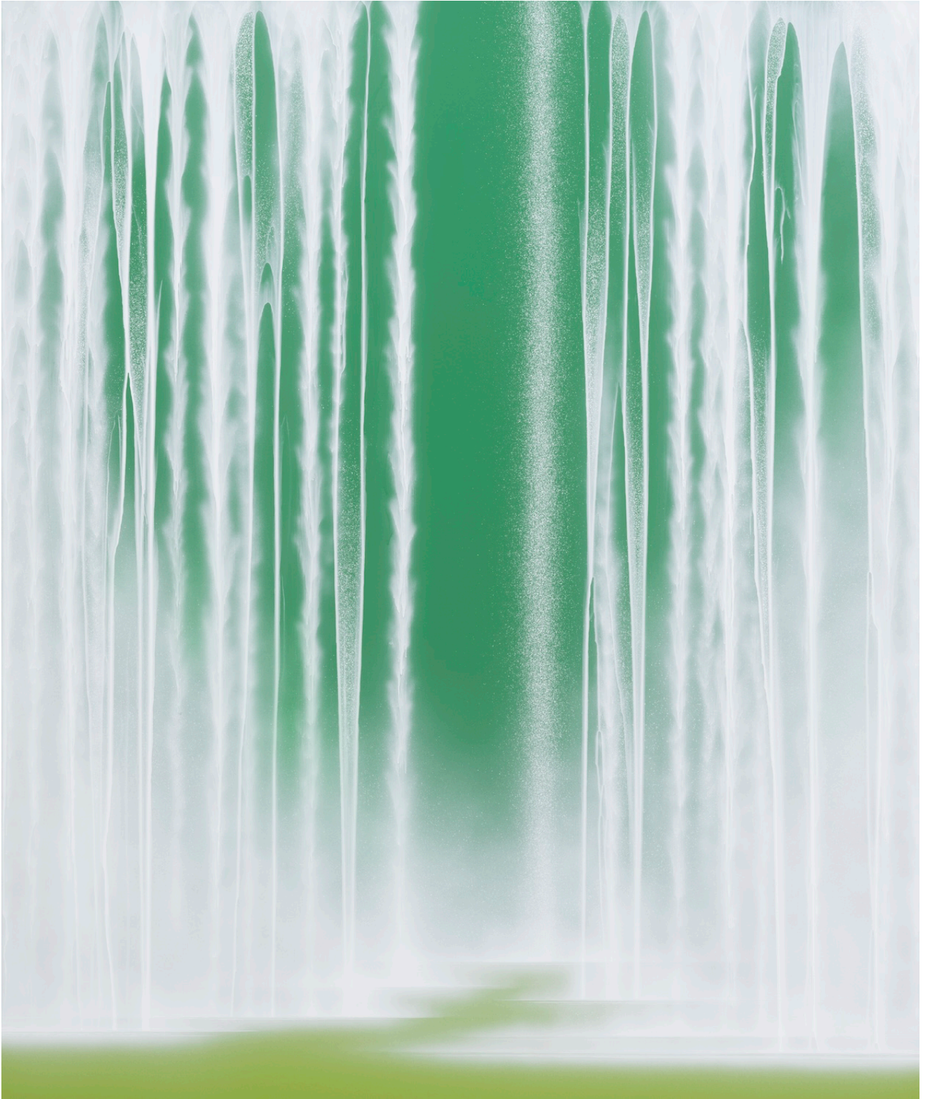
Dayfall/Nightfall painting by Hiroshi Senju, 2025

Senju's use of fluorescent material under black light speaks to the rhythms of modern existence, and echoes the psychological space we inhabit in cities illuminated by artificial light. Senju's waterfalls are not about erosion or fall, but about continuity and rebirth.