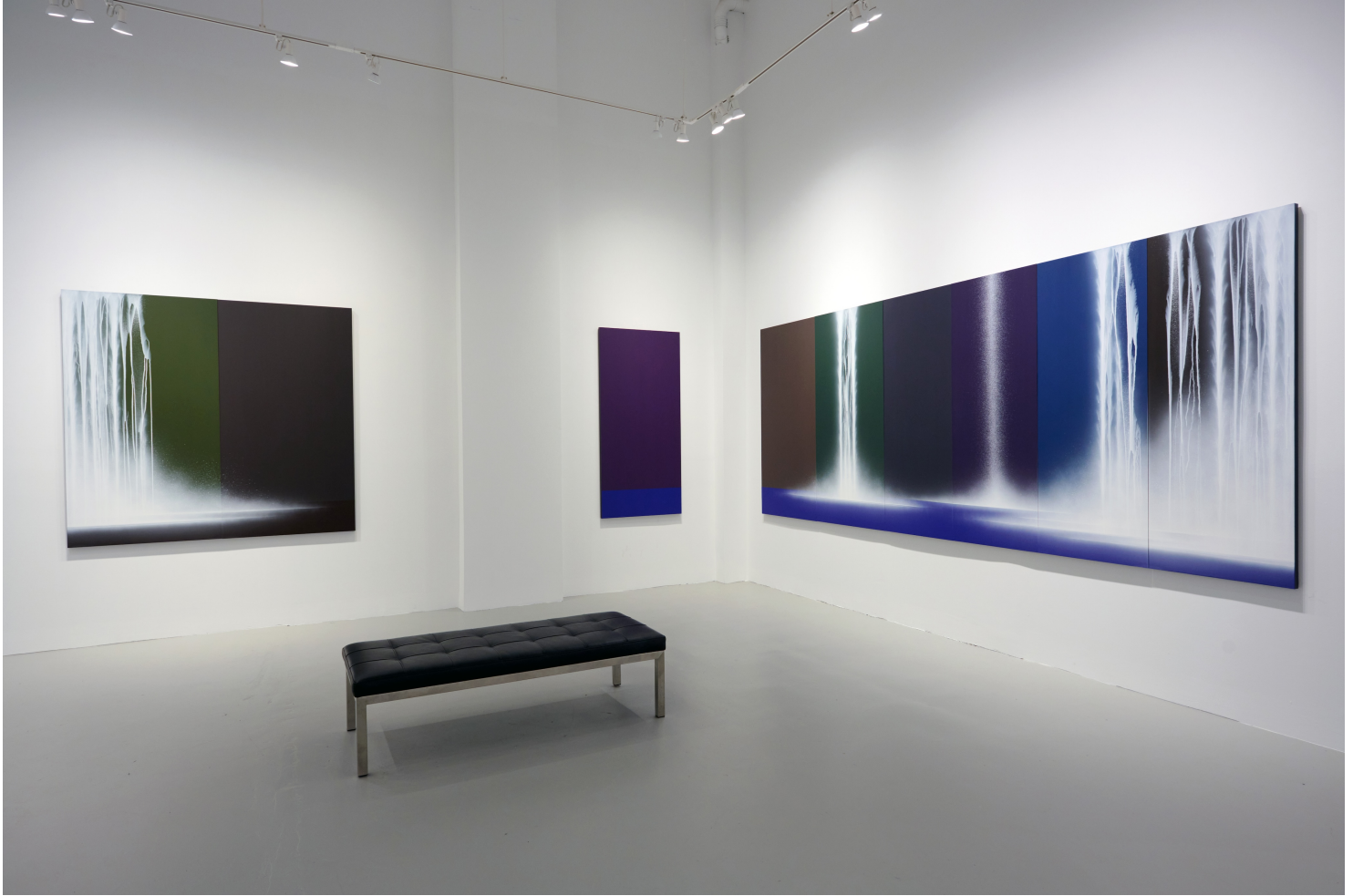
Paintings by Hiroshi Senju. Installation image courtesy Sundaram Tagore Gallery, 2025