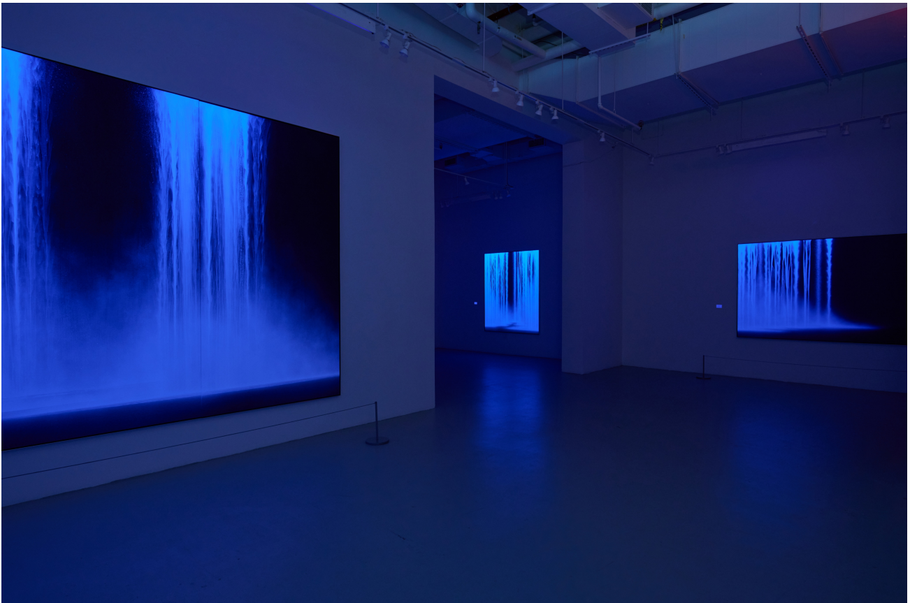
Paintings by Hiroshi Senju.