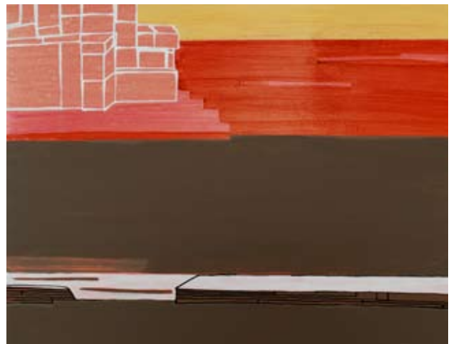
Right: west mirage , 2009, acrylic on panel, 16.5 x 21.5 inches

Hong Kong, February 29, 2012 — For her first solo show in Asia, mid-career American artist Frances Barth presents imaginary landscapes that are at once confounding and sublime. Her radically abstract paintings possess a startling graphic clarity and are made of lush combinations of unnamable colors—saturated blue-grays, fiery orange-reds, and pale yellow-greens—that don't exist in nature.