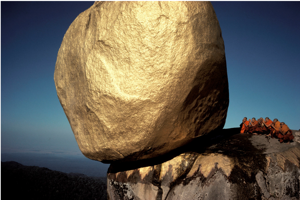
Hiroji Kubota, Kyaiktiyo, Burma , 1978, dye-transfer print, 20 x 24 inches/50.8 x 61 cm

Contact Sundaram Tagore Chelsea: 212-677-4520 / press@sundaramtagore.com