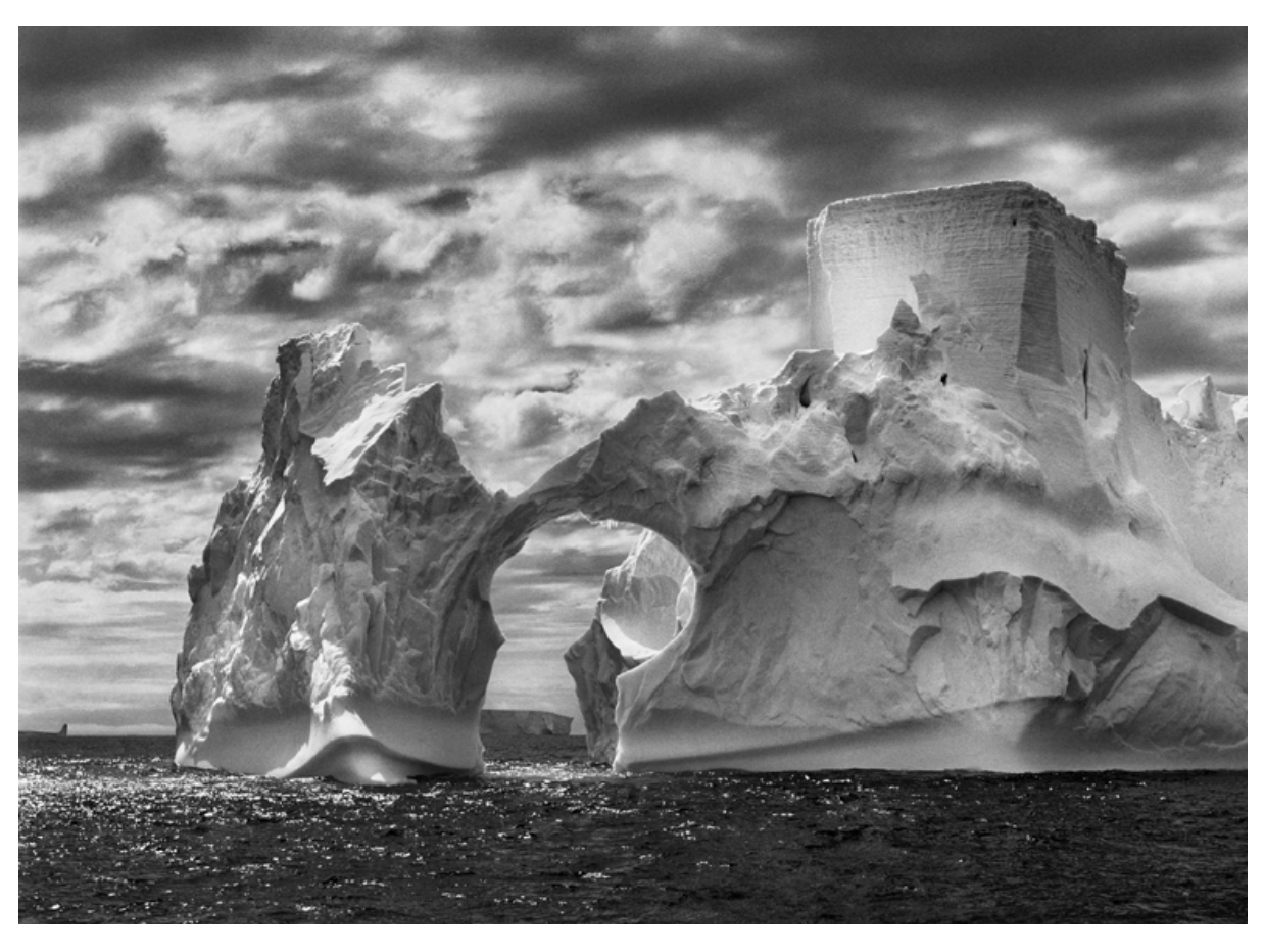
Sebastião Salgado, Iceberg Between Paulet Islands and the Shetland Islands, Antarctica , 2005, gelatin silver print, 36 x 50 inches / 92 x 127 cm

CONTACT: Esther Bland, +852 2581 9678 / press@sundaramtagore.com