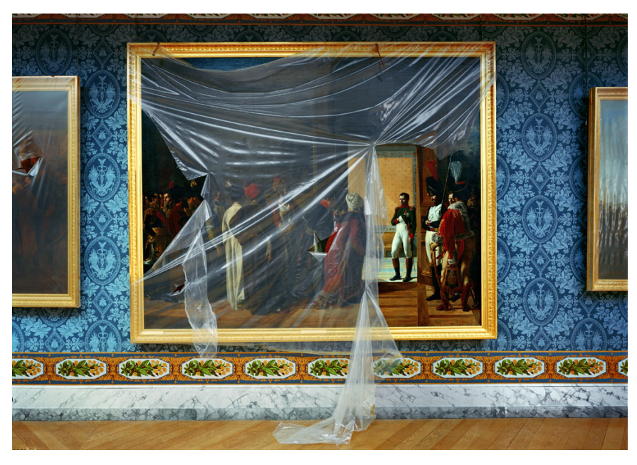
Robert Polidori, AMI.04.001, Attique du Midi, Aile du Midi - Attique, Château de Versailles, France , 2005, archival inkjet print, 40 x 54 inches / 101.6 x 137.2 cm

Steve McCurry has been honored with some of the most prestigious awards in the industry, including the Robert Capa Gold Medal, National Press Photographers Award, and an unprecedented four first prize awards from the World Press Photo contest. In 2013 the Minister of French Culture appointed him Knight of the Order of Arts and Letters. Most recently, the Royal Photographic Society in London awarded McCurry the Centenary Medal for Lifetime Achievement. McCurry has scores of book and magazine covers and countless exhibitions to his credit.