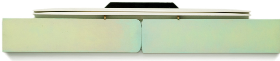
Pono , 2023, acrylic on fabric on wood, 11 x 58 inches

CLICK HERE TO BROWSE SELECTED EXHIBITION IMAGES