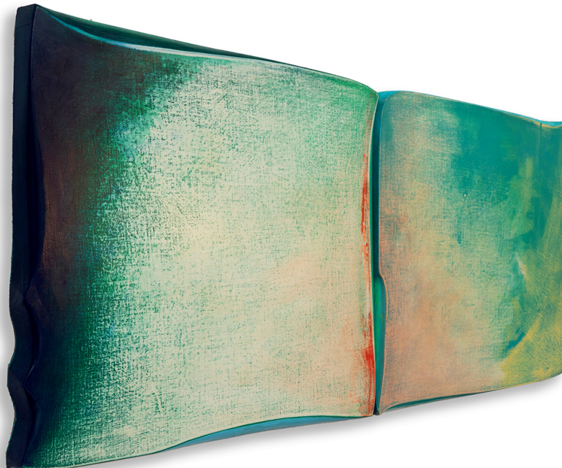
Waimea , 2022, acrylic on fabric on wood, 22 x 52 inches

Contact us: press@sundaramtagore.com / 212-677-4520