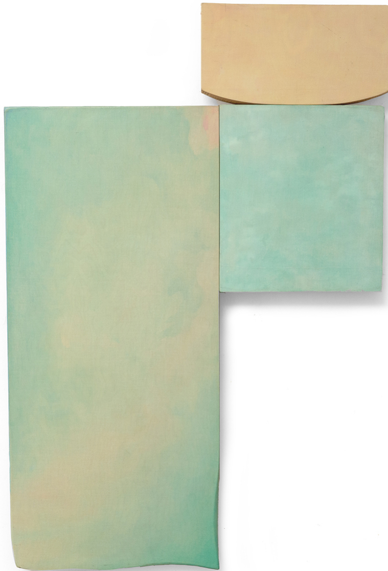
Aloha , 2022, acrylic on fabric on wood, 48 x 32 inches

Yasuda begins by shaping wooden panels, which are up to two inches thick, with chisels and grinders. Softening harsh vertical lines, he introduces bowed and gently sloping edges as well as sharply upturned corners. After painting a base layer onto the wood, he wraps the wood in diaphanous cotton. Adding as many as 40 coats of pearlescent acrylic paint, he suspends the fabric amid layers of luminous color. Most of his works are multi-paneled, with intricately wrought and detailed seams, and mounted on cradle-like structures that push them away from the wall.